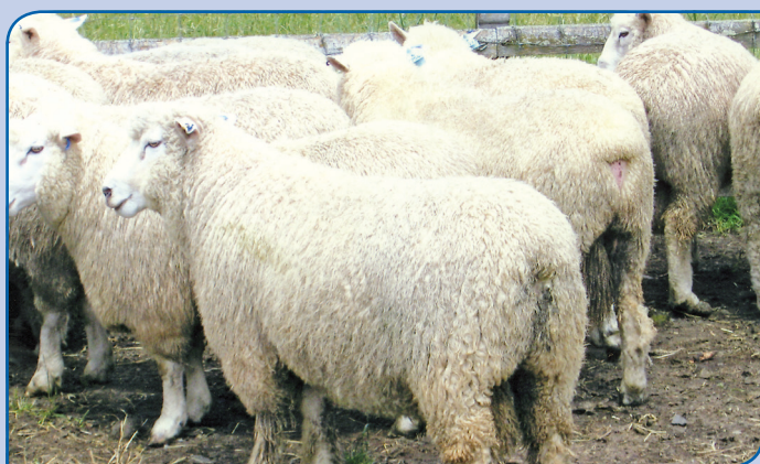
1/4 Finn 1/4 Texel 1/2 Romney