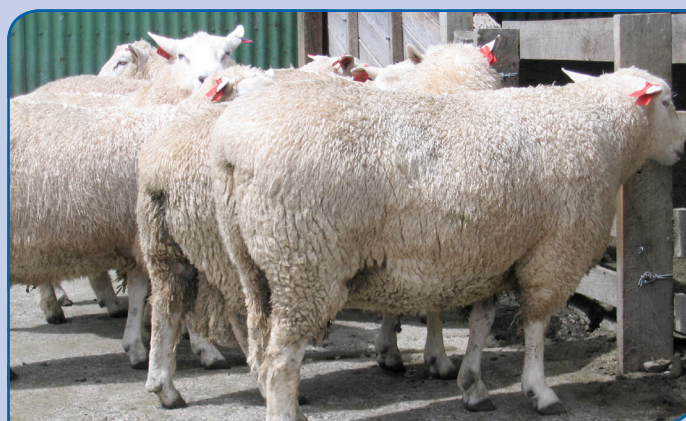
1/4 Finn 1/4 Texel 1/2 Perendale