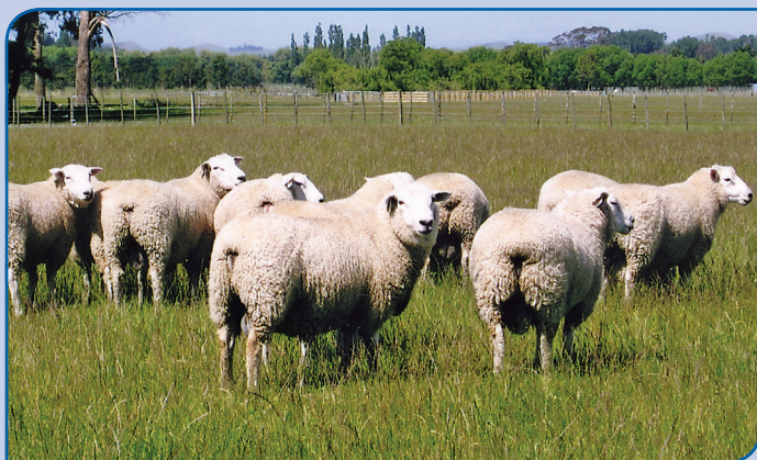
3/8 Finn 3/8 Texel 1/4 Romney