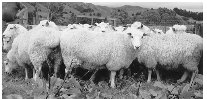
Stabilised 1/4 Finn, 1/4 Texel, 1/2 Perendale, Two-Tooths. 'Tarata', March 2005