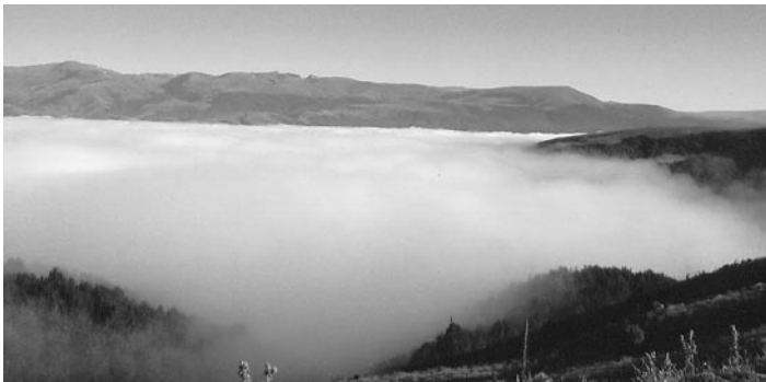
Argyle Station tops. Spectacular, interesting, well managed Southland, January 2005.