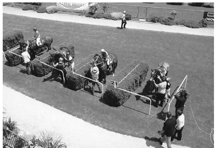
Hastings races. No excitement, few spectators, no talking. January 15, 2005

Family business's tend to be 'best' environmentally and socially. Would it not be in New Zealand's best interests to cut up Landcorp now and assist young farmers onto 'first' farms? Agribusiness's ultimately fail and are bought by offshore companies. This will happen to Fonterra.