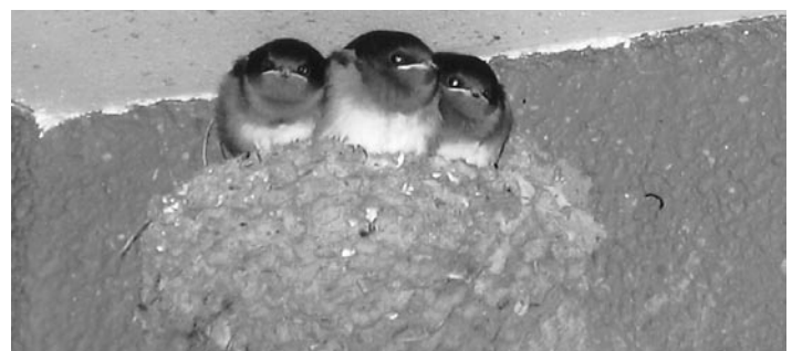
Welcome; welcome swallows. Fledglings about to leave the nest. 'Paratu', December 2004

If a contractor died when his spreader rolled, the farmer is guilty of Industrial Murder if everything has not been checked beforehand on the truck and on the farm to prevent the accident. NSW.