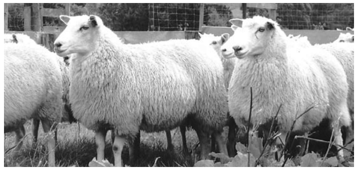
Stabilised 3/8 Finn, 3/8 Texel, 1/4 Romney Two-Tooths. 'Tarata', March 2005