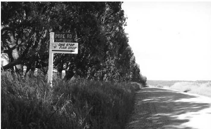
OSRS South roadsign. Pope Road, Slope Point, Southland.