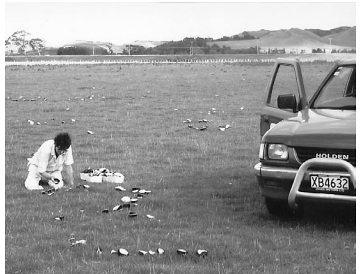
The Joy of picking mushrooms. Plenty for friends. Warm March rains bought on this seasonal delight. 'Burnside'