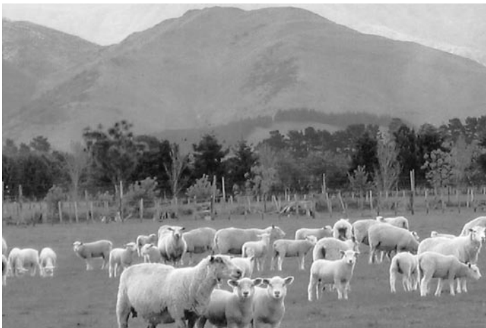
Finn-Texel ewes with lambs at Block IV. Maire hill in background. 'Tarata', December 2004