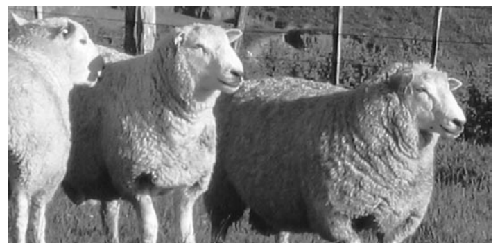
Stabilised 3/8s and Finn-Texel Rams at Tarata. March 2005