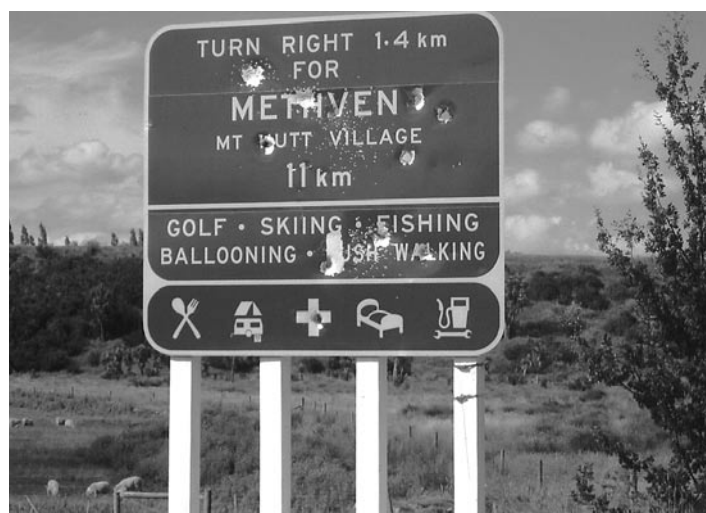
Idiots have wrecked signs. $100,000 damage in Marlborough, Nelson and West Coast alone. Canterbury, January 2005

Six year old Finn-Romney ewes from Kaiwera were too good for a terminal sire and were mated to \frac{3}{4} Texel \frac{1}{4} Finn rams whose progeny will be \frac{3}{8} Texel \frac{3}{8} Finn \frac{1}{4} Romneys.