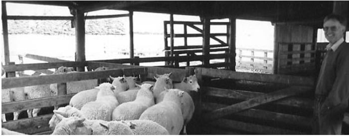
Ram selection. Jamie Holmden full of grins. Jamie has bought rams for a decade. These ¼ Finn ¼ Texel ½ Perendale rams are for his Kahuranaki Farm. Hawkes Bay, OSRS, December 2004

OSRS hogget mating. Texel Suffolk ram X Texel Suffolk ewes averaged 44 kg LW when mated in May 2004. Lambs survived horrible spring weather. Feed was always short. All lambs were weaned at 56 days average age. LW was 23.9 kg . Growth rate 355 gms/day. (A generous 4kg birth weight was given each lamb).