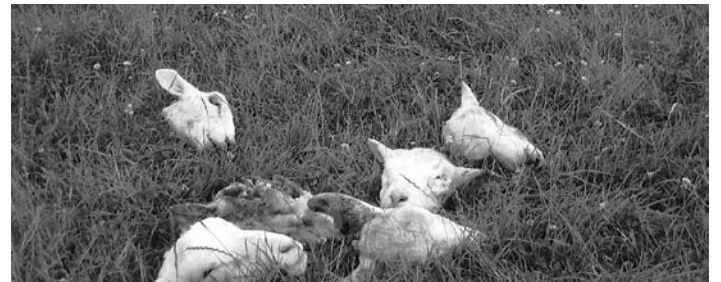
Farm 'invasion'. Thieves left only seven heads after killing OSRS lambs next to State Highway 2 on the Takapau Plains. Very public. 'Burnside', 23/12/04