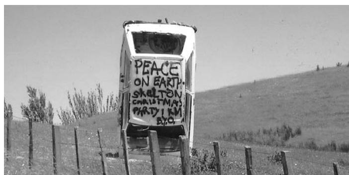
Pongaroa notice board. Party time. January 2005