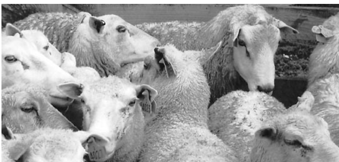
Sexy Pure Finn ram amongst his harem. 'Burnside', 14-4-05

Sheepmeat - this quality 'health' food is in undersupply internationally forever. There is no chance of major competition. Prospects have never been better.