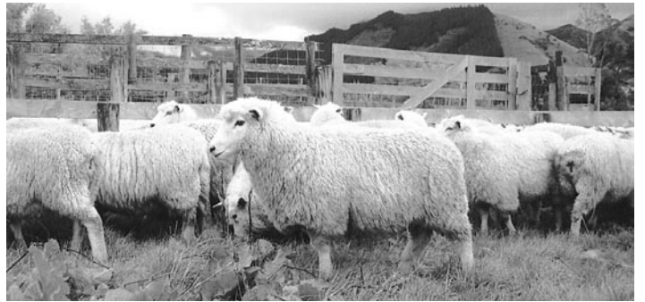
Stabilised 1/4 Finn, 1/4 Texel, 1/2 Romney, Two-Tooths. 'Tarata', March 2005