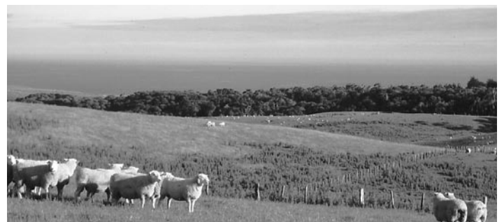
Views; OSRS South. Sweeping vistas and good-looking, grumpy sheep. Slope Point, February 2005

Unfortunately parliament failed to say what the principles are, so the courts have had to invent them as they go along.