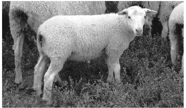
Dorper cross lamb from a Finn Texel hogget. Born mid October. No lambing troubles and negligible losses. 'Tarata', December 2004

'Countrywide' (Nov) articles discussed the risks of using ram hoggets as sires. Many vets do not recommend the practice. OSRS sells two-tooth rams which are mature and have completed 15 months of competition with their peers. Recording is completed, wool type, confirmation and size is consistent. All rams are palpated before sale. Ram hoggets are sold when some specialised genetic combinations are in short supply.