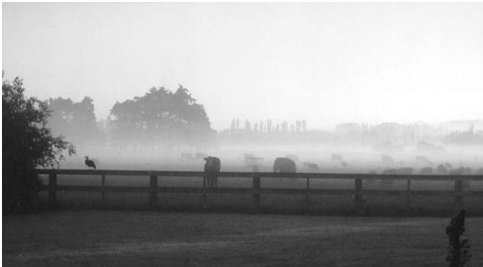
Spring. Paradise duck, sheep, curious cattle and mist. 'Paratu', October 2004

This is a practical, no fuss website which is updated regularly with descriptions of OSRS/TMG activities, newspaper articles about clients and our business. Have a look, you'll be interested.