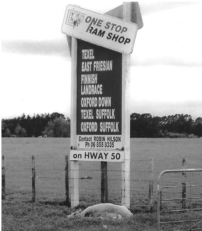
Front page in NZ Herald. A neighbour's dead ewe under the OSRS sign on State Highway 2. January 26 2005