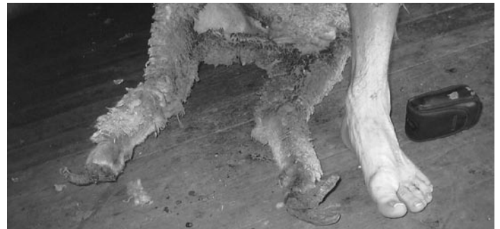
So much work. Paring feet. LHS merino, RHS North Canterbury farmer. One only has good feet. Oxford, January 2005

OSRS offered fifteen breeds of sheep for sale as two tooth in 2004/05. Eleven categories were completely 'sold out'. This has never been achieved, by OSRS, before.