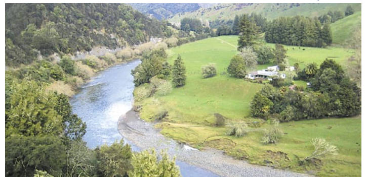
The Wanganui River wanders through the King Country past pockets of easy-country encircled by steep hills. Very beautiful. Forgotten World Highway, Taumarunui, August 2005