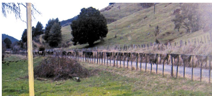
54 pig skins; a smelly fence.

Farmers are the best custodians; they 'love' the land.