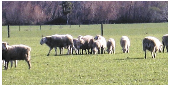
Mating dorper ewes with April-May born lambs at foot. Seven rams hassling a ewe. 'Burnside' 20 August, 2005