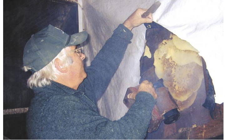
Wild bees in the Paratu woolshed. Home grown honey. January, 2005