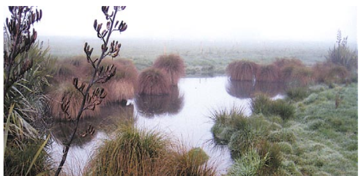
'Paratu' wetlands. Fenced and planted with hundreds of native plants; this should look terrific in five hundred years.