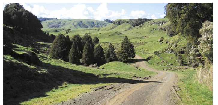
King Country roads disappear into tight valleys, only to much later, reach a farm or two. Kakahi Road, Ohura, August 2005