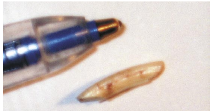
What is this object? Answer, page 2. Bottom LHS column.