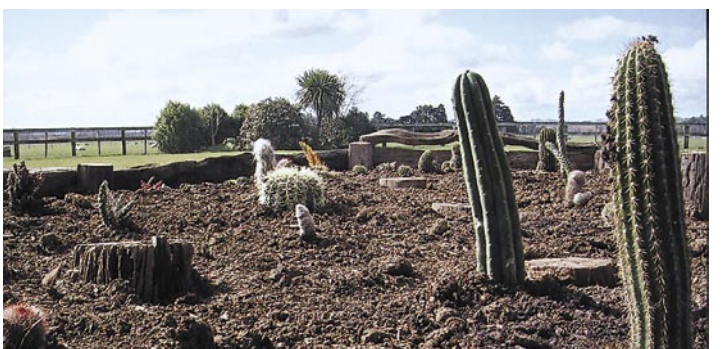
Baja Takapau (OSRS). These cacti are not prickly enough. 'Paratu' August 2005