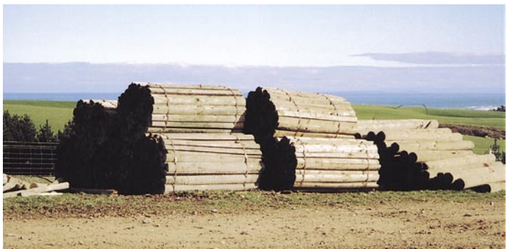
Huge quantities of materials have been used in the conversion of the new McDonald farm from 'character building rawness' to a productive unit.