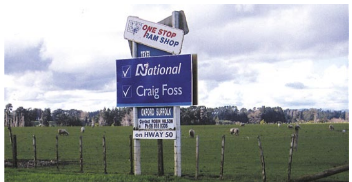
OSRS sign on SH2. Time for a change of government.

PS. Please plant a Rata over my earthy remains.