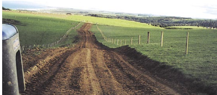
Arterial lanes thread for kilometres to every part of this startling farm now. Every direction has a stunning view. Slope Point.