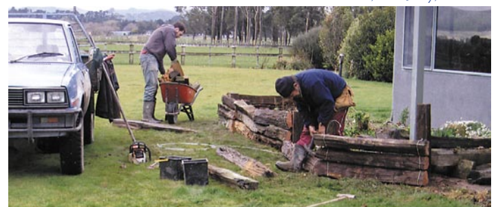
Creating Baja Takapau. Neale (UK wwoofer) helping Walter Cresswell (OSRS) mould a structure from recycled posts.