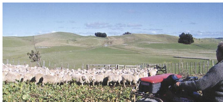
These 600 Finn Texel hoggets from Bennydale were contract reared at Taihape. The owner is a BOP farmer. 72% are in lamb to terminal sires. Attractive hoggets which have excellent potential after being well cared for over winter.