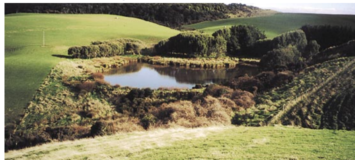
Fenced off wetland with bush remanent. Forest bounces back quickly in Southland when livestock and possums are removed. Pope Rd, OSRS South