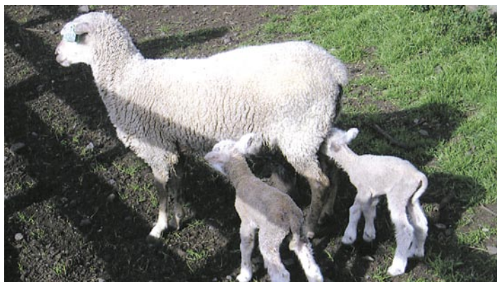
Muffin and her twin lambs.