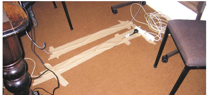
A huge room with a handful of people but OSH says 'tape over the extension cords'. DOC, Napier, 27 July, 2005