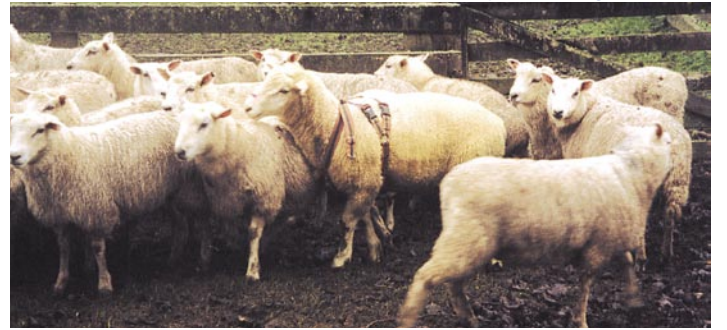
OSRS Finn Texel ewe hoggets joined to a highly facial excema tolerant ram. Kirikau, OSRS West, May 2005