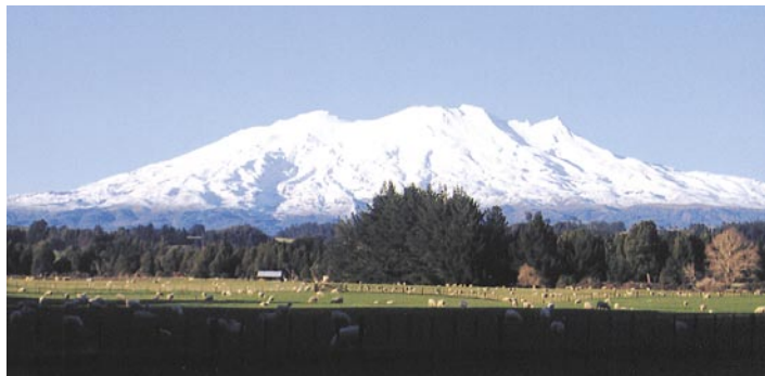
Two of New Zealand's finest sights. Ruapehu and lots of sheep.