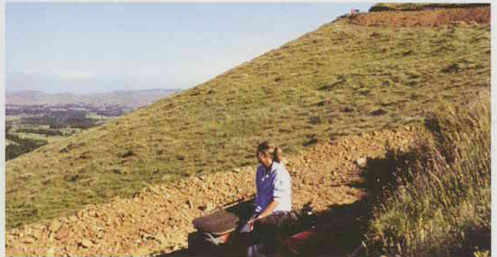
New tracks and fence lines on Maire Hill. Tarata, February 2006