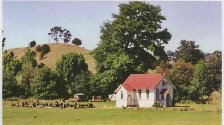
The Tadmor church has a cemetery but does it have a congregation? Nelson, February 2006