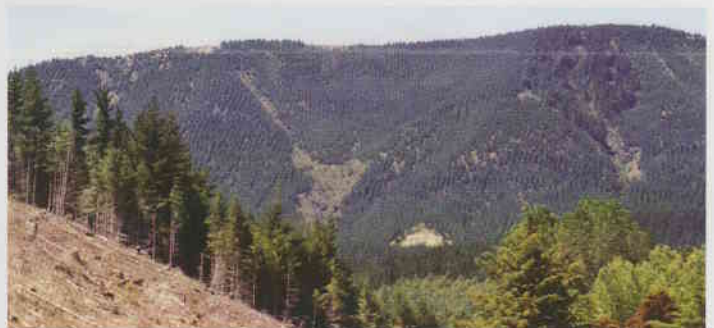
An unusual outline in a forest, the North Island.