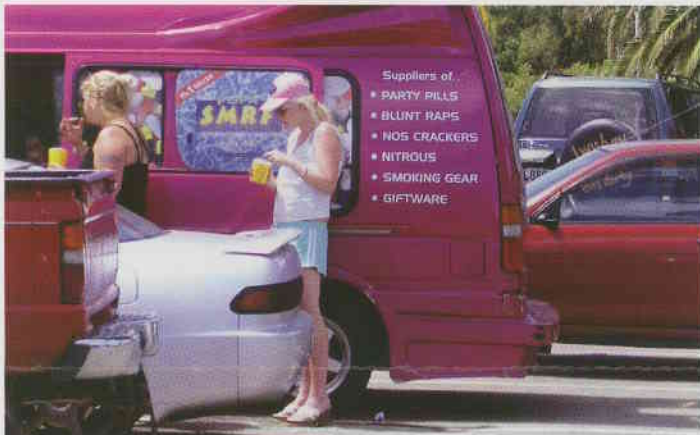
Nelson folk at play. Poisons for mind and body, so necessary, if you wish to 'enjoy' yourself. Tahunanui Beach January 2006