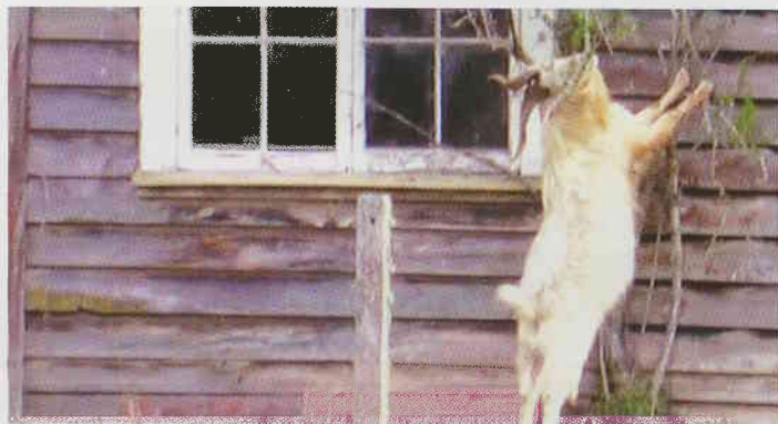
Caretaker, Billygoat Gruff pruning cottage roses at Endean's Waimiha Mill.