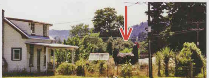
Nelson has big mountains, big rivers and even big Moa bones but his chook is very big . Tadmor, February 2006