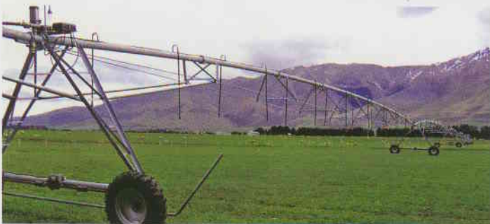
Pivots everywhere. Water allocation has become a major South Island issue (as predicted in 2000). Kurow, October 2005