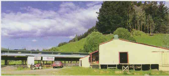
Open day; before the crowd. The line of the new covered yard compliments the artistic line of Kirikau Valley's oldest woolshed. OSRS West, October 2005