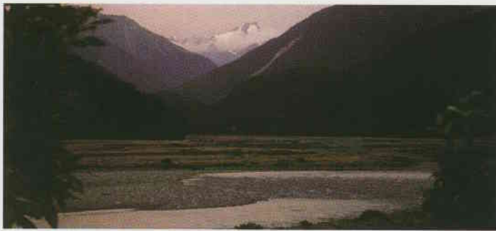
Haast. 9.30pm. River plains and Landsborough Mountains. So very inspiring. January 2006