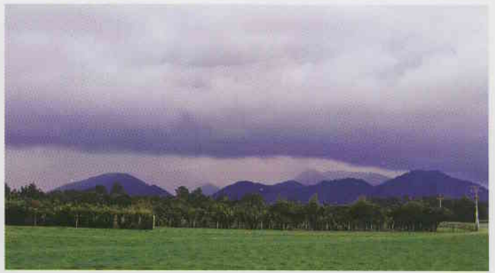
Tarata. OSRS's dark hills reach 800m asl. Some of the shelter planting and lush pastures of Block 4 fill the foreground. Overcast weather is a feature of climate change. Tarata, January 2006