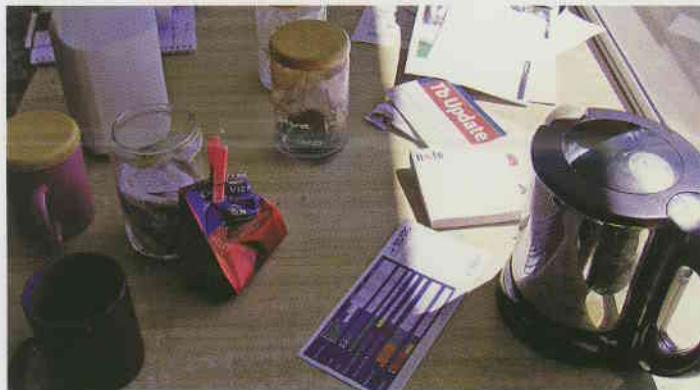
Tea, coffee, biscuits, OSRS/TMG, newsletter. Now for a serious read. Balfour, Southland, October 2005