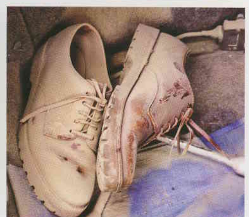
A boot full of dust. Seals do not keep out dust gathered from 14311 kms driven on roads and farms in the South Island this season.