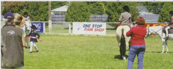
Sponsorship. OSRS has sponsored riding events, Horse of the Year competitions (Hastings), horse races, an art exhibition (Wellington), a motorcyclist (USA), shearing competitions (Tapawera). CHB, A&P Show, November 2005