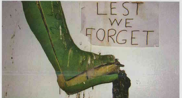
'Lest we Forget'. Two starling forgot how to get out of Ivan's old cast. Starlings are very poohy birds; very messy birds, who never clean up their messes.