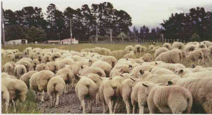
Texel ewes and lambs on the road; about to be shorn and weaned. Tarata, January 2006