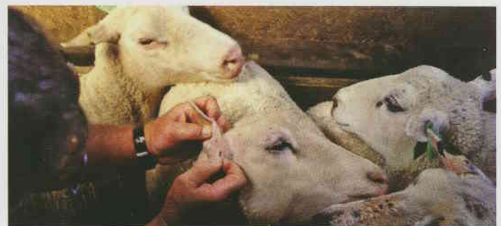
Blood collection. A tiny prick is made in the ewe's ear, blood flows and is smudged onto a blotter which is sent to Melbourne where the DNA pattern is recorded.