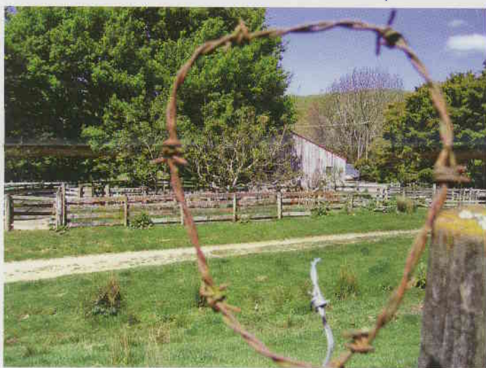
Scene through a barb-wire loop; the stuff of fairy tales. Serene old sheds and timbers. Riwaka Valley, Nelson October