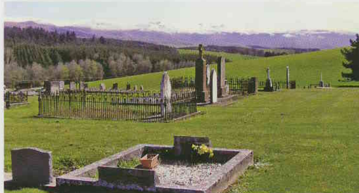
Waikaia Cemetery. A very private place amongst spectacular scenery. Gravestones tell of death by freezing and drowning. Destitute people trudged through here looking for work on the gold-fields of Central Otago or the bush clearing of Southland. A place worth visiting. Southland, October 2005