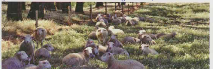
Sociable Dorpers. They graze together, they move together, they rest together. Paratu. February 2006