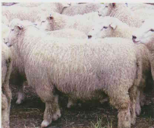
14 month, 1/4 Finn 1/4 Texel 1/2 Romney sale rams.