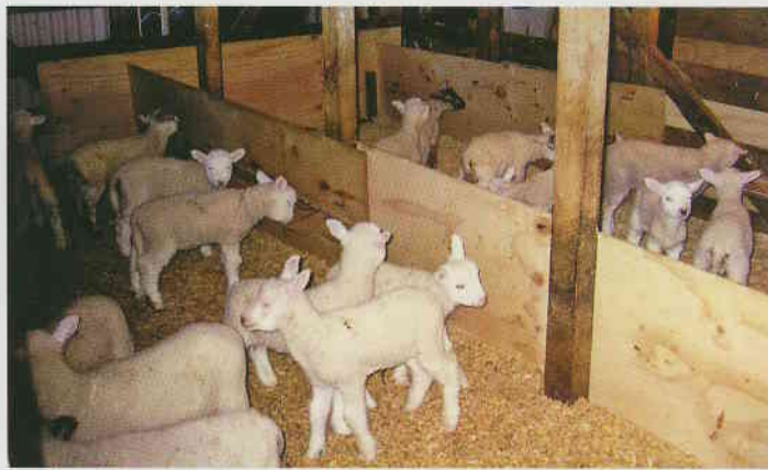
Lamb rearing is 'in'. Farmers spend little time with 'easy-care' Finn Texel ewes. Time is available to rear surplus/spare lambs. This is a profitable practice.

Chris and Amie Gardner, Cambridge, 12 September 2005