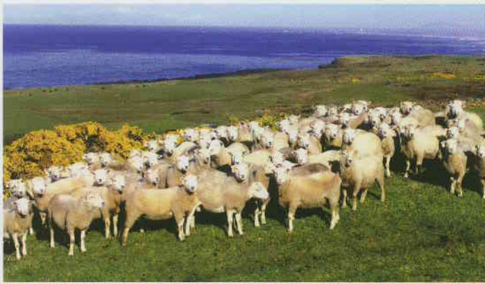
The bottom end. Fragile sand-dune pasture predominates along the coast. Stewart Island and Bluff Hill are just visible.