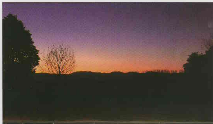
Mountains which excluded sunsets from the Tarata homestead make a definite line for colour splashes when viewed from Paratu. Red sky at night; shepherd's delight. October 2005