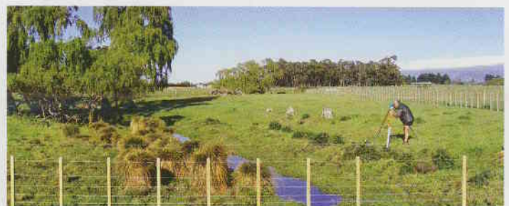
John Cheyne (HB Fish & Game) surveying the site for a dam which will increase the OSRS wetlands. Streams are double fenced and planted in mostly indigenous flora. Many kilometres have been completed at Tarata.