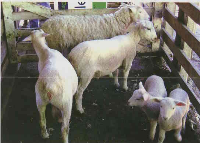
Dorper ewe with her October twins and her April twins. Open day 2005.