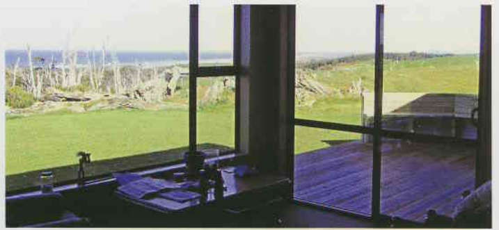
Long sweeping panoramic views of Foveaux Strait from the McDonald homestead. Constantly changing seascapes are fascinating. Tourist liners sail past like moving cities.