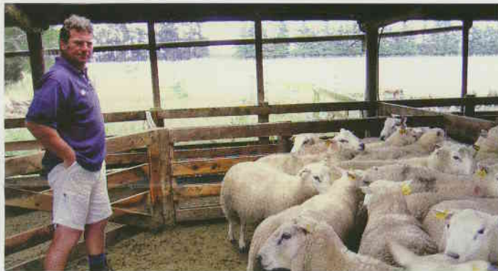
Farmers are encouraged to select their two-tooth rams at any of three NZ outlets. Richard Loe (Oxford) selected Finn Texel rams to use over romney ewes.