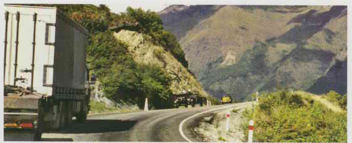
Road rage brewing. Vintage car enthusiasts really delay traffic enormously. Drivers seem unwilling to pull over.