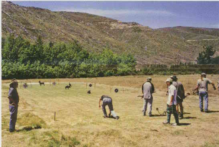
Nelson folk at play. Rather wild looking bowmen shoot at 'americanised' targets (a racoon and bighorn ram.) Success in the wild involves stealth, exercise and hard walking.