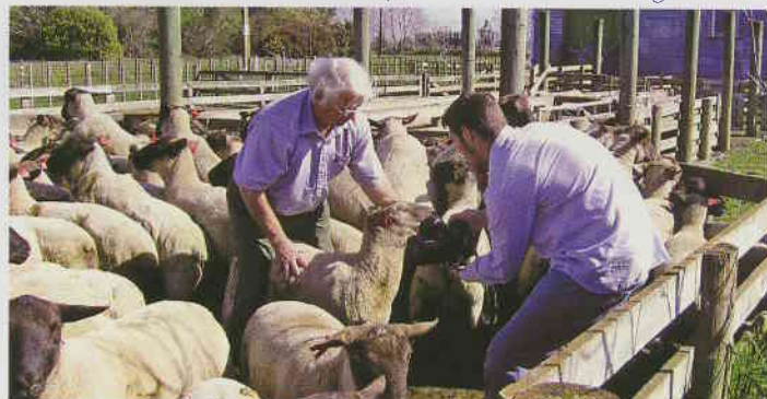
Photographing. 'In the face photography' by Steven McNicholl, for an article about OSRS in the Hawke's Bay Today.