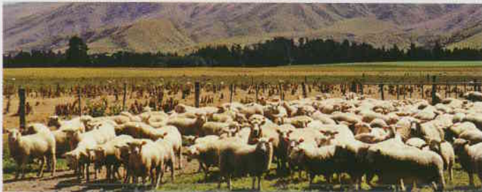
Sherwood Downs. Normally dry. Easterlies have kept the country green. Another record lambing. Excellent Finn Texel lambs. Stephen Crone, Fairlie, January 28, 2006