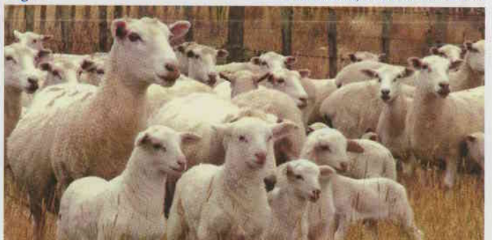
Christmas lambs from Dorper ewes, which were mated in August (photo, newsletter 54); 134% lambing. OSRS, December 2005