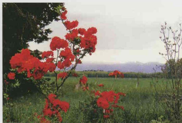
Azaleas and Rhododendrons have shifted well from Tarata, but life will never be easy for them down from the hills. Spring. Paratu, October 2005