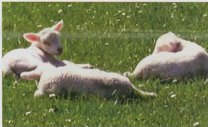
Finn Texel Lambs. Spring. Dipton, Southland October 2005