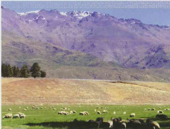
Mt Pisa. Great craggy purple peaks. Spring terraces white with grape vines. Irrigated flats. Finn Merino ewes have been farmed for 10 years; now Finn/Texel/Merinos.