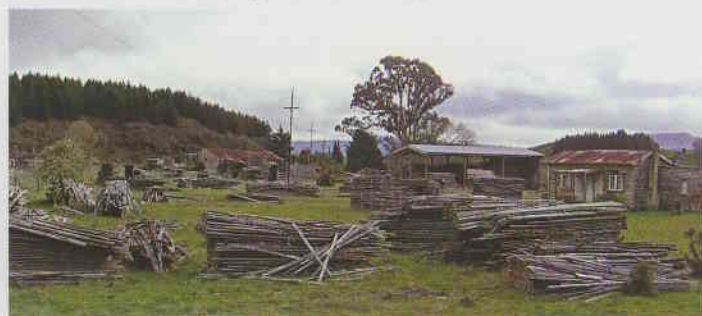
A whole community went in 1990, when Endean's mill closed. Stacks of timber, 'sad' mill houses and goats are all that remain after 60 years of frenetic activity. Waimiha, August 2005