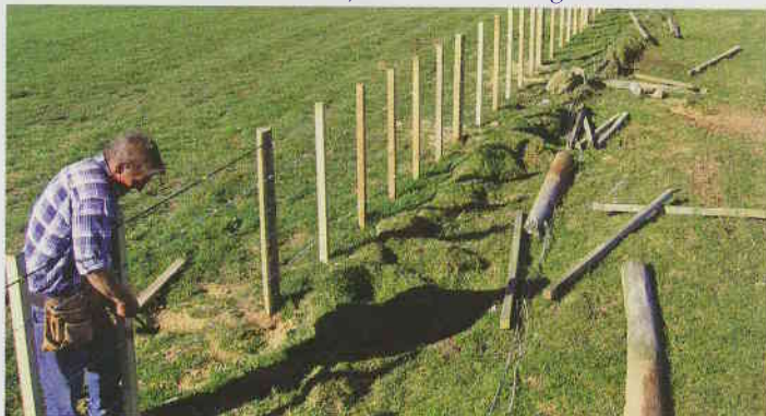
A new fence was needed, so Walter built it. Every farm needs a 'Walter'. Deer made the ground uneven. Deer wreck fences.