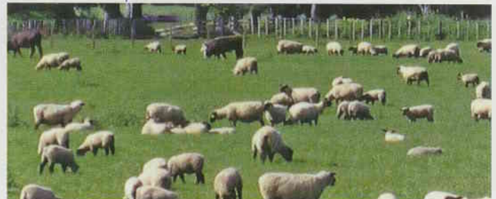
Texel Suffolk ewes and lambs. 1200 ewes are mated annually. The flock was established in 1991. All lambs were weaned at 100 days and averaged 42.33kg live weight, a growth rate of 383 gms per day. Ram singles averaged 43.15kg and multiples 36.05 kg L.W.