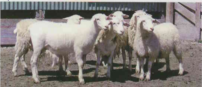
Shedding Wool. April born lambs (7/8 Dorper) at various stages of shedding. Only occasionally are pieces of dorper wool found in paddocks or yards. Burnside, October 2005