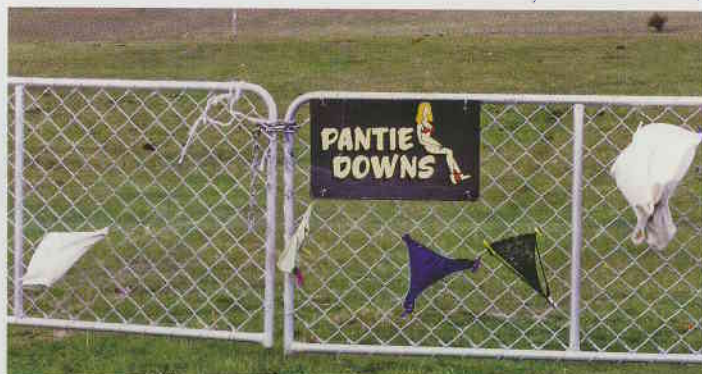
Farm names sometimes attract surprising responses; 'Pantie Downs'. Hyde, Central Otago, October 2005