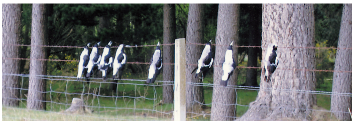
A Magpie fence.