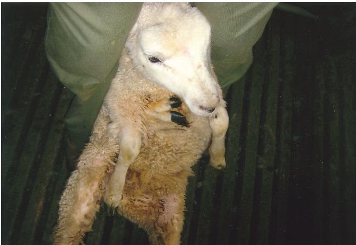
A six legged lamb. Two extra legs. Tarata, 2006