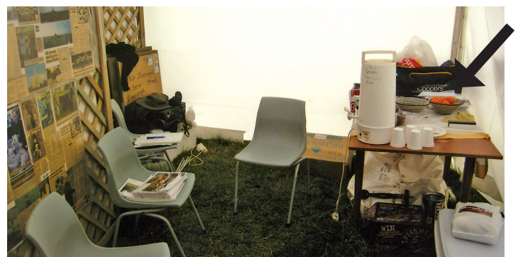
Office. Endless tea and coffee. Yummy Central Otago apricots and nectarines. (arrow)