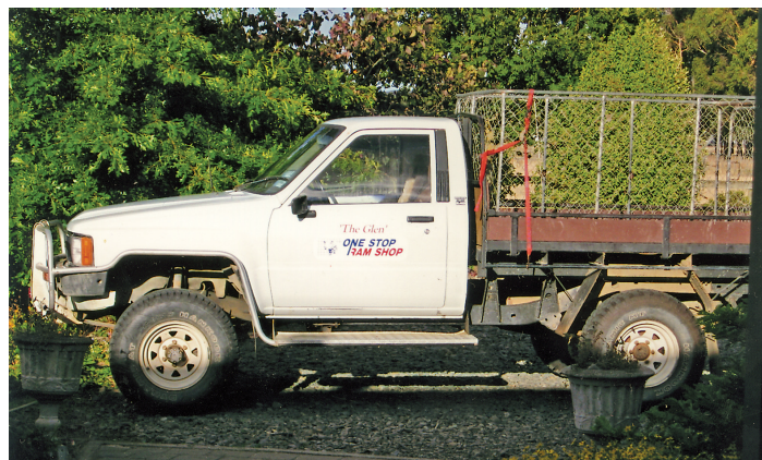
One Stop Ram Shop — The Glen.