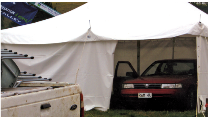
Waimumu. The start. Ram 4U hiding from the heavy rain.

No wonder the Southern Field Days were such a buzz for us.