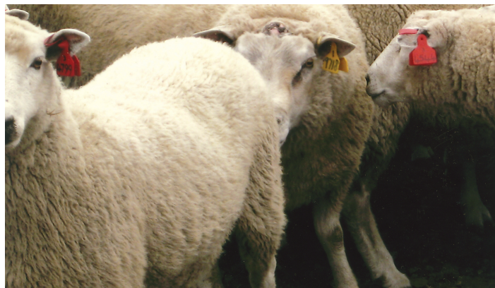
Tupping time again. Ewes and rams in excellent condition. Heaps of rain and warm temperatures. OSRS, March 20, 2006

Texel Suffolk lambs averaged 37.21 kg live weight at weaning; not 42.33 kg as written in newsletter 55. This result was excellent and reflected the ability of this breed to grow fast, 350 gms per day for the whole mob was achieved at OSRS, Takapau.