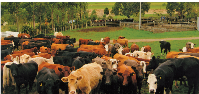
Pregnancy testing 300 cows at Tarata. Cows 'clean up' paddocks with excessive summer growth. All cattle are sold prime.