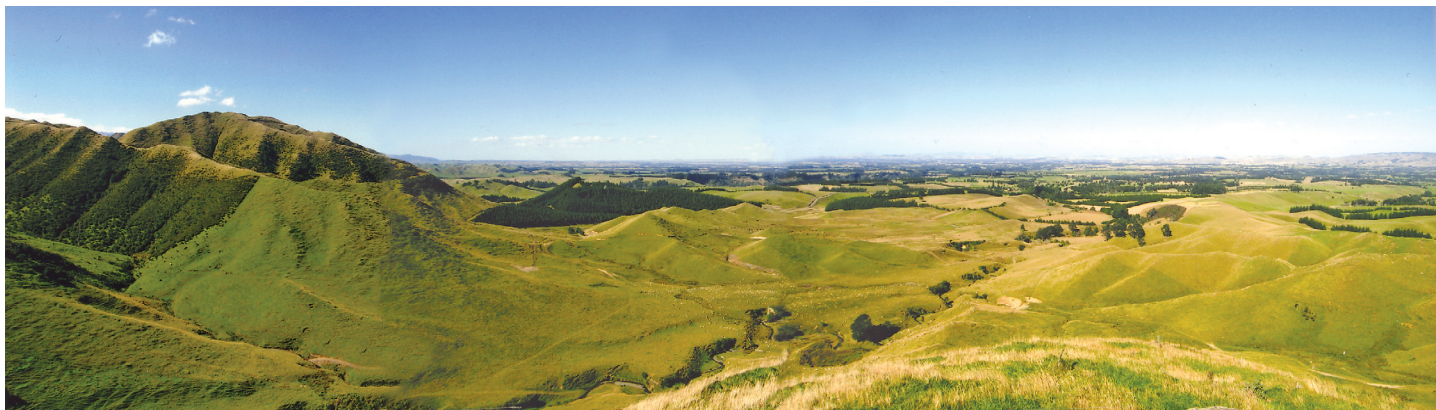
Looking NE over Tarata. Maire Hill has a new track at the top. Forests and shelter belts contrast the summer green of OSRS's hills. OSRS has over 40kms of shelter belts and 40 ha for production forest. March, 2006