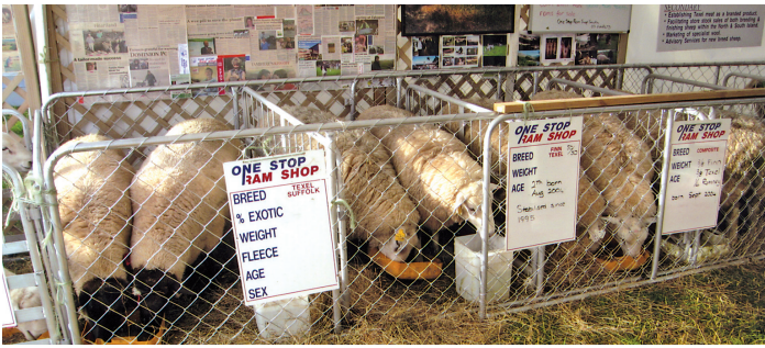
Rams penned. Seven genotypes did 'not wilt' over three days.