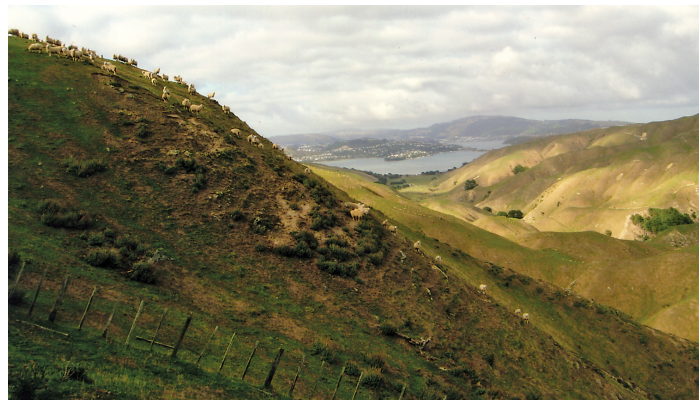
Glorious views of Porirua and Pauatahanui Inlets from 'The Glen' tops. February, 2006