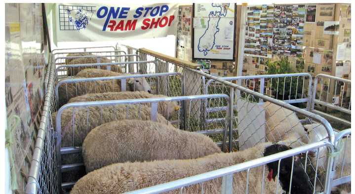
Layout. Friendly. Easy viewing. Plenty of information. Lots of Photos.