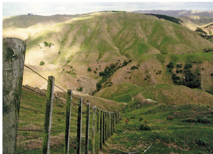
Very steep greywacke hills, rise up 500 metres from sea level. Fencing this country is difficult. Very dry pastures from spring until March. Tough farm, steep. 'The Glen', February 2006