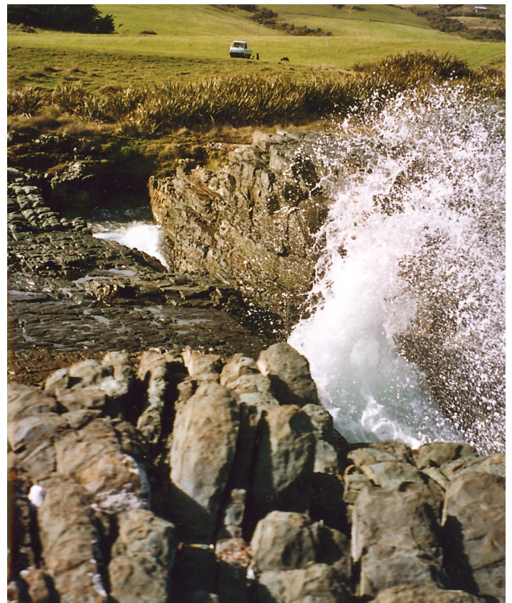
The Bottom End. Riverton/Longbush. Healthy, country which grows excellent Texel-Perendales.