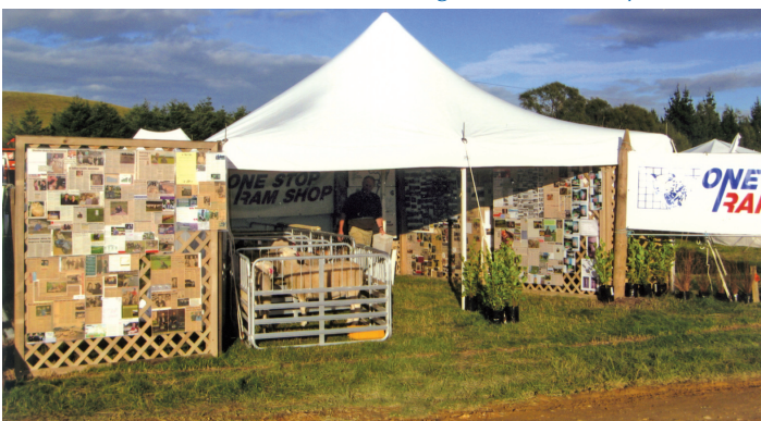
Ready for visitors.