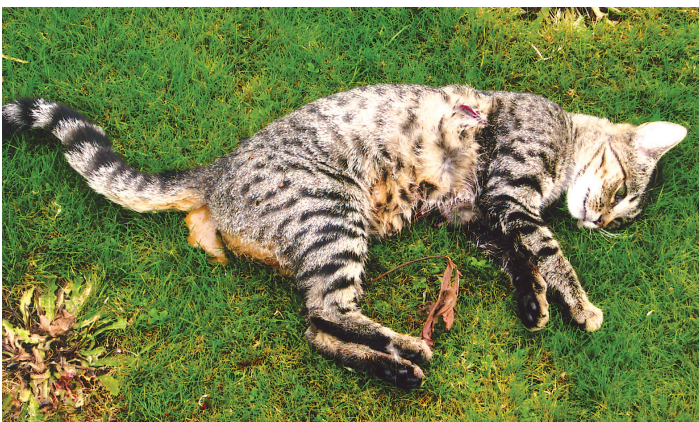
Feral cats are common throughout all the OSRS wet lands. Farmers need a simple method for killing these disease carrying pests.