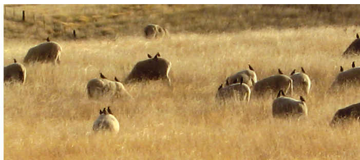
Starlings grandstanding. Waipara N Canterbury, Feb 2006