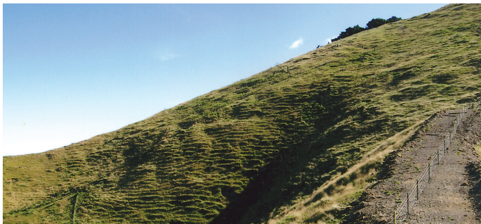
Fencing. Kilometres of new fences, repair fencing and tracking has been completed at Tarata. Five fencers have given the farm a new look. Steep Stuff, Come and see.