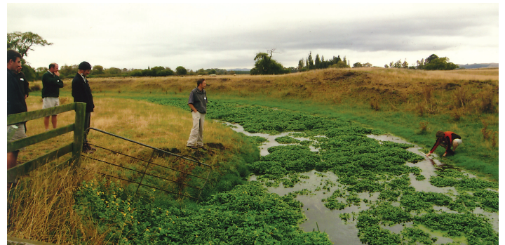
NIWA and Ag First ran a field day about sustainable farming, for local farmers. Water quality of this spring, (120,000 litres per hr) was faultless; pure. Burnside, 21 March, 2006