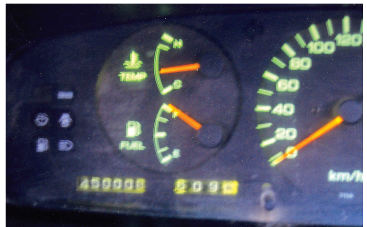
Kilmog, Dunedin. 450,000 kms. Ram4U. 22 October, 2006