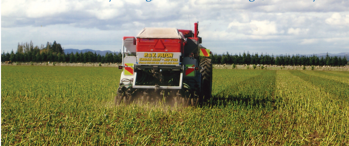
OSRS uses contractors extensively. 70ha were oversown by cross-slot drill. OSRS has a minimal amount of agricultural machinery, eight motorbikes and six utes are the work horses.