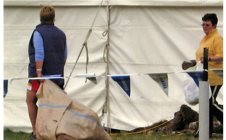
Southlanders, do it so well. Dozens of volunteers the Field Days tick. Helpful, courteous and forever cheerful. Many scooted though the whole area at closing time picking up rubbish. Each new day the place was spotless .