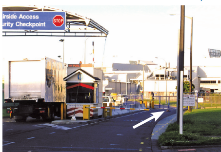
Auckland, airport security. The arrow highlights an 'article' on the road at the security point, totally ignored. 14 Nov.