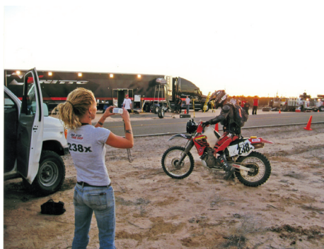
8 Away. Service truck, with all mod-cons, 12 staff, all for a truck racer.