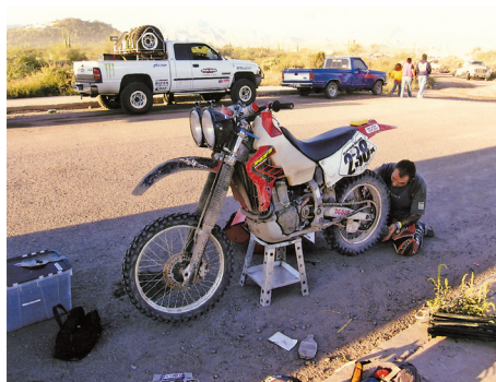
16 Loreto. Made it. Luck. A loose axle. Racing time lost. 1243 kms.