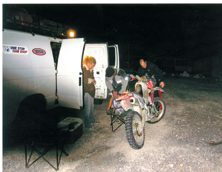
9 Abreojos. 4 hours fast drive. 10pm. 856kms, travelled. All is well.