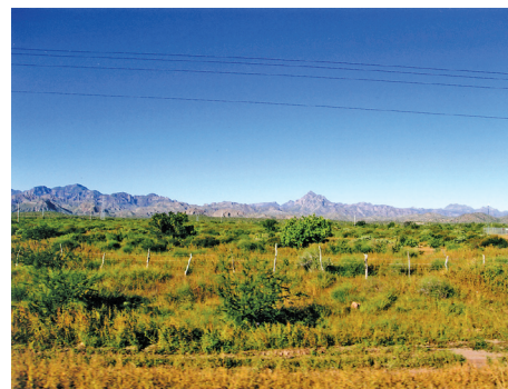
20 They race over sand flats and volcanic mountains, like Ruapehu.