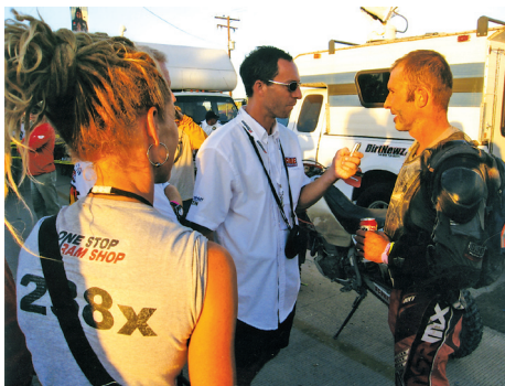
23 Tired, elated. Interviewed for US audiences. Worth the effort.