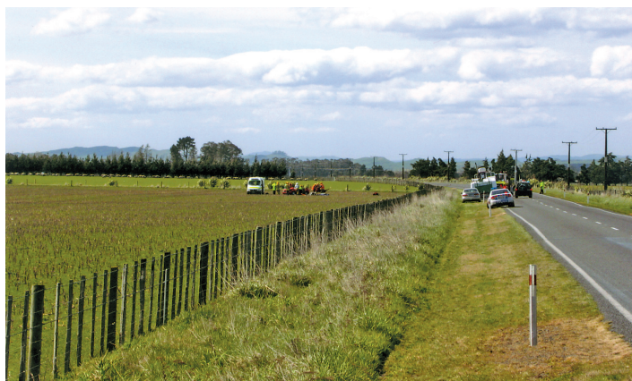
Another OSRS fence smashed, SH2. Three more in January.

Do the Mainland (SI) biotechnology researchers appreciate the seriousness of FE?