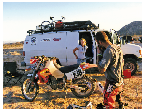
7 30 minute stop. Feed, drink. Lights on bike. Clean up.