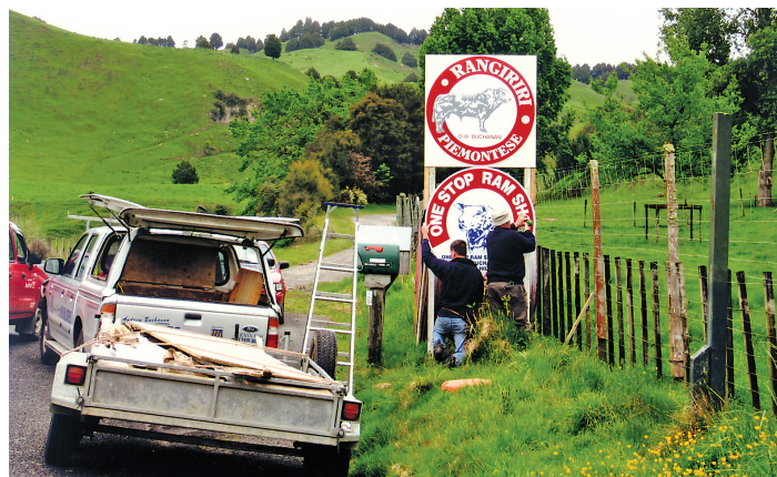
New gates signs for the Openday. OSRS West. 28-10-06.