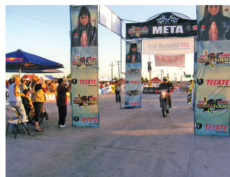
22 LaPaz, Finish. 1678 kms. Adoring crowd. Elated support crew. Go Kiwi!