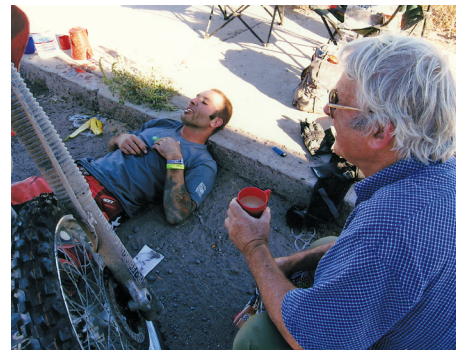
17 Rest, repair bike. Racer; tired but ok. 7am. Everybody cheerful. No Sleep.