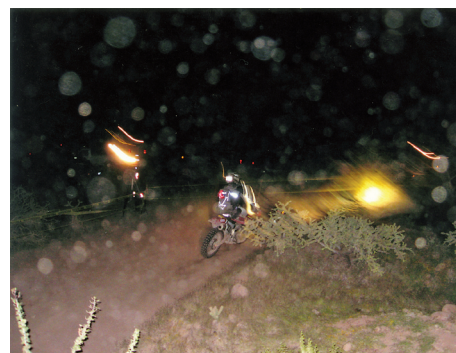
10 White Bridge. Dust everywhere. 2am. 1158 kms. Spectacular.