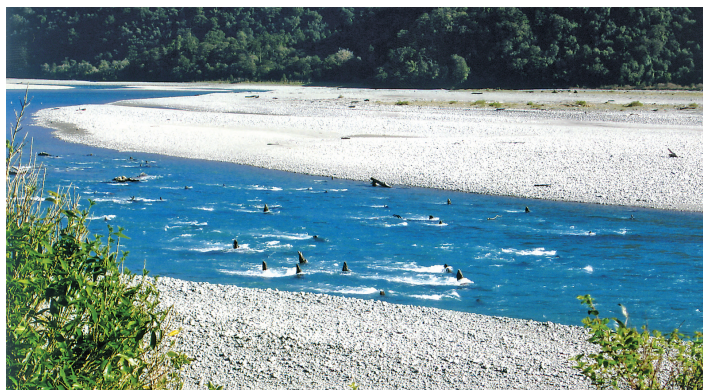
Haast river with a school of sharks? 5-10-06.

INTERNATIONAL NEWSLETTER No. 61 January 2007