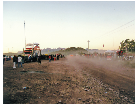
15 Screaming, dusty truck-gone. All Loreto watching. Clean camera again!