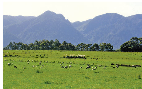
Productivity in a beautiful setting. Finn Texels at Collingwood catch many a tourist camera. Len Win, Nelson. Oct, 06.