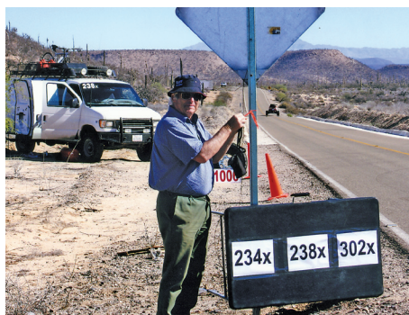
6 La Bay. 8 hour drive. Signs for racers. 603 kms. Very Hot.