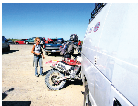
21 Santa Rita. Tension. Honda fuel pit shutting. 1508 kms. Tough section next.