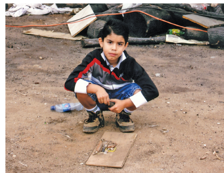
2 Designs of street plastic. Ensenada.