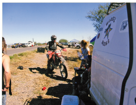
19 Insurgentes. 1368kms. Hot, weary. Blazing sun.