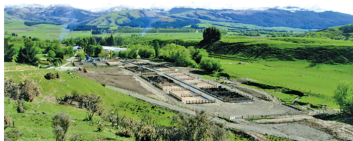
Argyle Station cattle fattening pad. A large property which is being transformed thoughtfully. Waikaia, Southland. 10-10-06.