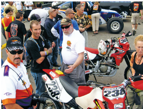
3 Official vehicle check. Anxiety, organised mayhem. Ensenada.