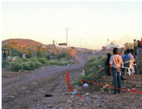
14 Loreto. Racing truck-coming. 6 am 1243 kms.