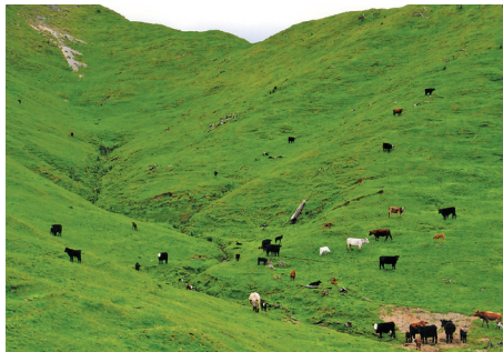
Tarata. Awful spring. Stock health good. Short grass for cows with calves.