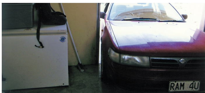
Ram 4U quietly drove into a farmer's garage at Haka; not a scratch. South Canterbury, Oct 2006.