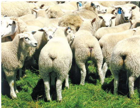
Texel ewes and lambs. Born late September. Tarata, Dec 2006.