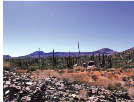
5 Typical Baja. Rocks, sand, cactus.