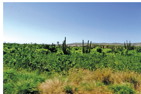
Green and lush. Not NZ, but Baja desert after rain, a rare sight.