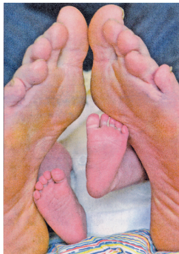
A photo to celebrate USA's 300 millionth citizen. The small feet were made for walking; the big ones cannot ; a cost of lifestyle.