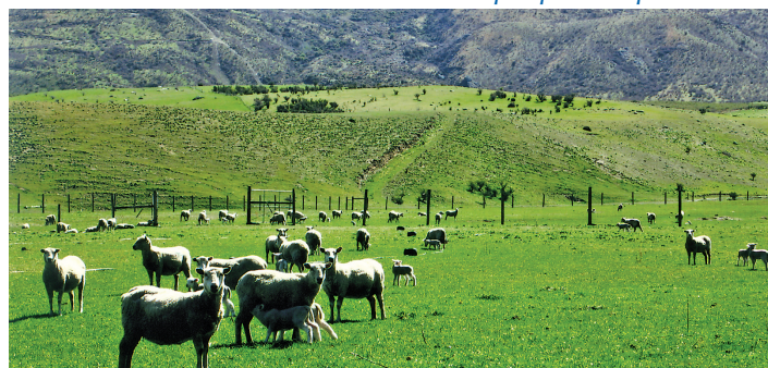
Spring. Outstanding Finn Texel/Merino hoggets with lambs. Sheep with ideal conformation and intelligence.

eg, Global warming is talked about by governments worldwide. People pushed politicians.