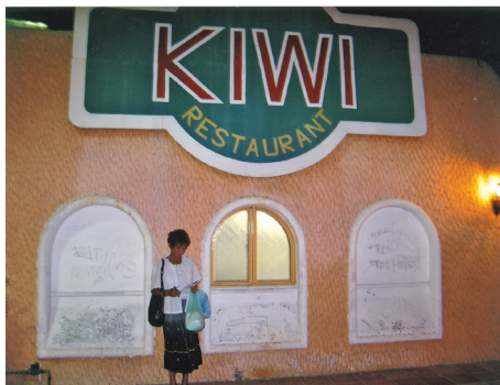
24 Kiwi bird ( Apteryx joyii ). Kiwi restaurant; La Paz. How odd!