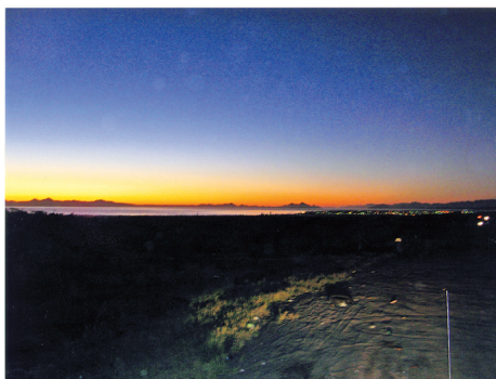
13 Dawn. Loreto lights. 4am.