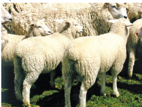
Finn Texel ewes and lambs. Easy to farm, tough sheep. Tarata, Dec 2006.