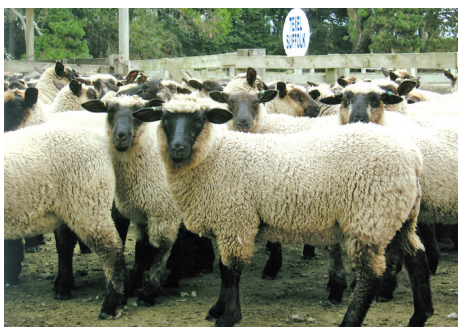
Texel Suffolk lambs. August born. Rams used NZ wide. Burnside, Dec 2006.