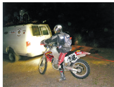
12 Cool. Riders are visible. 40 min stop. Noisy, spectacular.