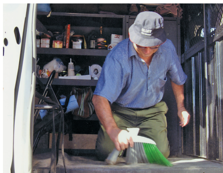
1 Cleaning the 'chaser' truck.