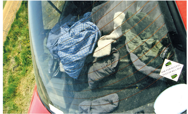
Drying washing in RAM 4U. Air and sun blasted. It works well.