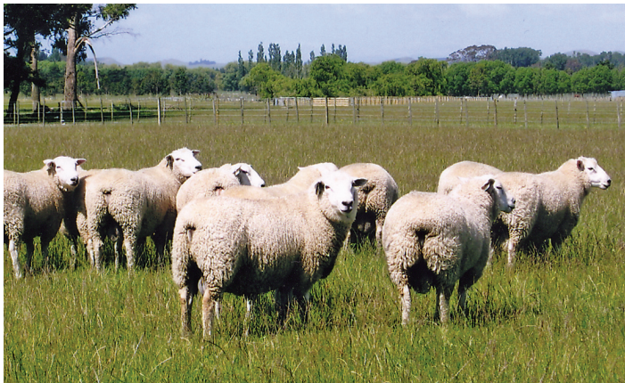
Stabilised \frac{3}{8} Finn, \frac{3}{8} Texel, \frac{1}{4} Romney Rams

If you're frustrated with the sheep meat industry, so are we all, but ponder these points