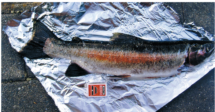
Makaretu River rainbow trout; delicious. Tarata, Jan 07

Do vegetarians get dentists to take out their canines or do they let them grow into tusks?