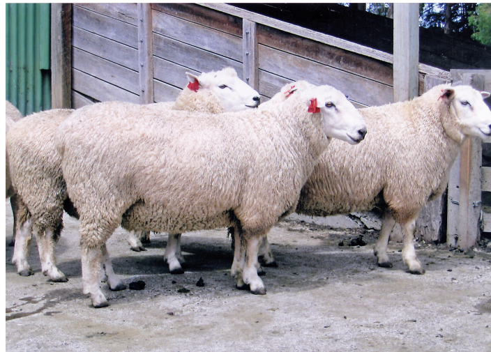
Stabilised 1/4 Finn, 1/4 Texel, 1/2 Perendale Rams