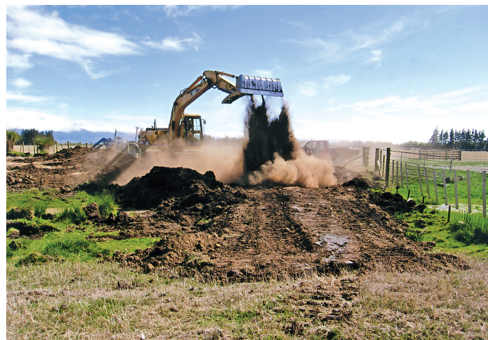
A conservation dam. NZ plants only. Paratu, April 07.