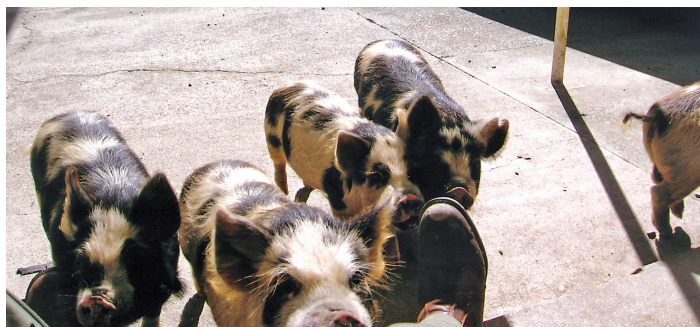
Southland kuni kuni's rushing to hear gossip about their cousins, Arthur and Martha, at OSRS, Hawke's Bay.