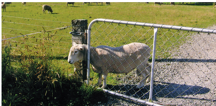
Good deed. This Clinton ram was released after much effort. Otago, Feb 07.

Now the Fijians can apologize because they killed ten natives, supposedly the murderers, in a revenge attack. Then, no more apologies please.