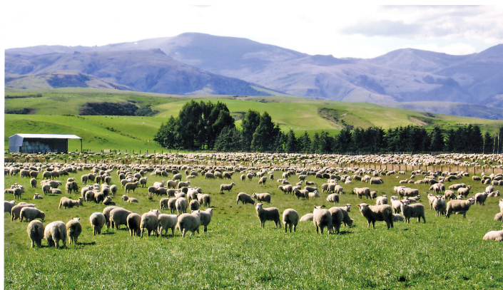
Attractive weaned \frac{1}{4} Finn, \frac{1}{4} Texel, \frac{1}{2} NZ whiteface lambs. Argyle Station, Waikaia. Feb 07,