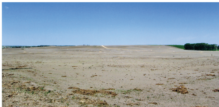
Dairy conversion. An old farm is gone. New pasture, new everything. Only possible with irrigation. Kurow