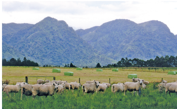
Len and Sheryl Win's stabilized ¼ Finn, ¼ Texel, ½ Romneys. All surplus dams are eagerly sought locally.