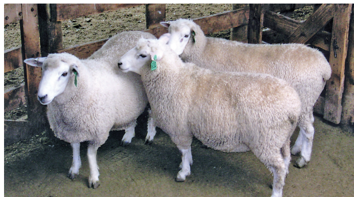
Facial Eczema Tolerant Crossbred Rams Kirikau, KC

Farmers need a proactive Board working for them or else why have it?