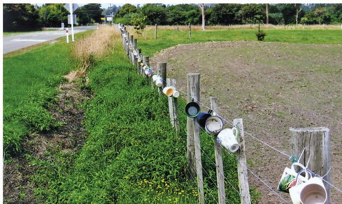
Refuse fences; mugs. Heaphy Track trampers leave mugs at Rockville. Collingwood, Feb 07.