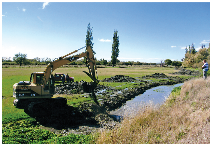
Stream cleaning. Springs have created three permanent streams. OSRS Burnside, March 07.