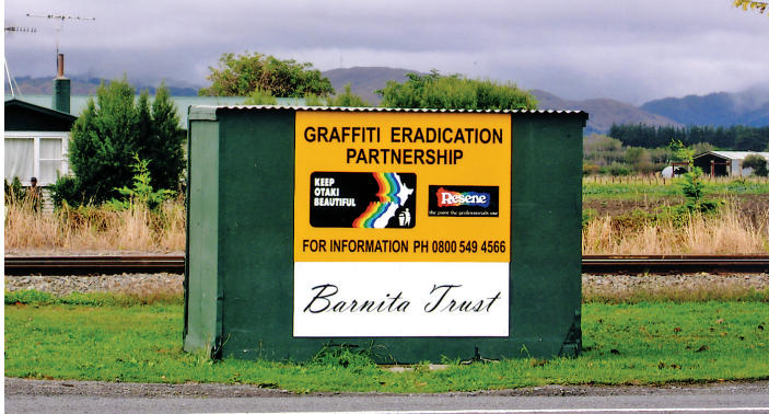
What is worse: the notice or graffiti?