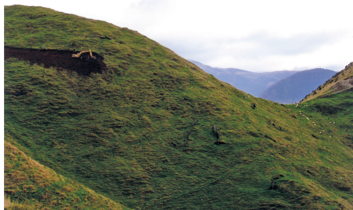
Trevor Rowlands track making.