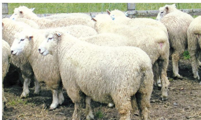
Stabilised \frac{1}{4} Finn \frac{1}{4} Texel \frac{1}{2} Romney Rams.

"Show a dorper ewe a photo of a ram and she will start ovulating."