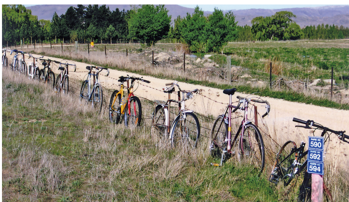
Refuse fence; old bikes. Fencing skills are being lost in rural NZ.