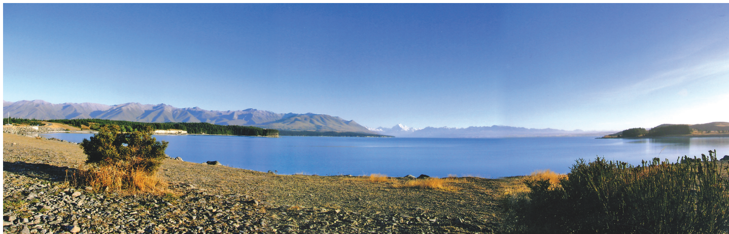
Lake Pukaki and Mt Cook. Sunrise, 6am.

INTERNATIONAL NEWSLETTER No. 64 September 2007