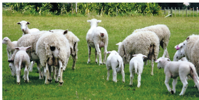
November born Dorpers.