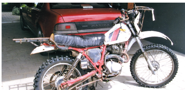
So old. This trusty 125 Honda has been everywhere for decades. Still going well. The paper on the carrier says One Stop Ram Shop so mechanics don't loose it amongst newer models.