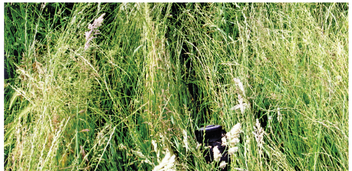
Grass covering young natives planted winter 2007 is good protection for young plants. Paratu. Jan, 2008.