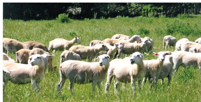
Dorper and Finn shorn ewe lambs on clover.