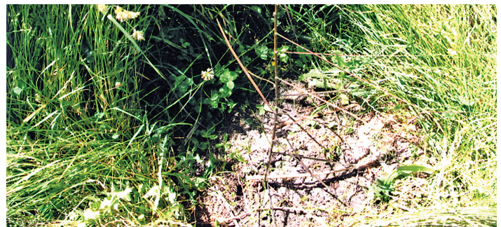
Winter planted. Released lancewood. Jan 2008.