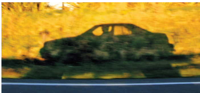
Shadows. Southland, last light. 'Boy' Racer.