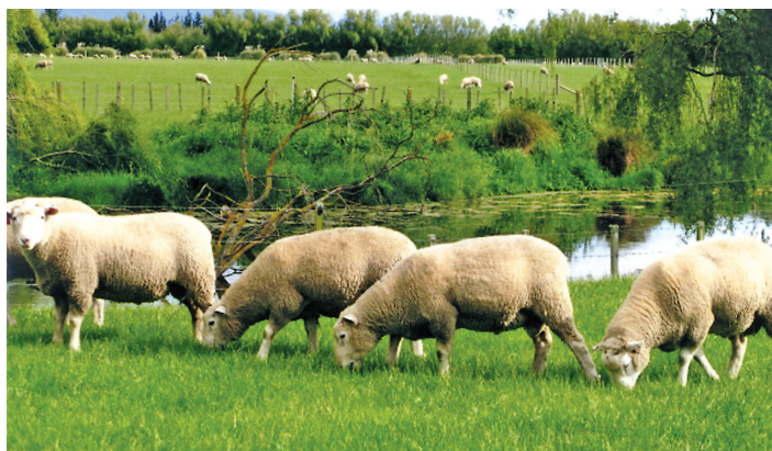
Stabilised 3/8 Fin 3/8 Texel 1/4 Perendale rams. Muscular, productive, grunty sheep. Paratu, Nov, 2007.