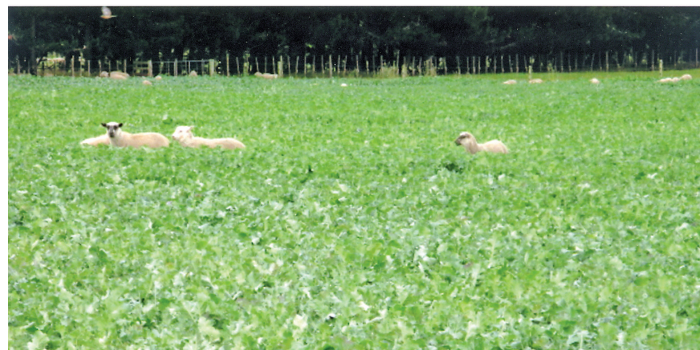
Burnside grazed 500 lambs from "The Glen'on a greenfeed crop for one month. 400 are ready for killing.