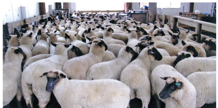
Freshly weaned Texel Suffolk lambs awaiting weighing (Averaged 37.8 kg) Burnside, Dec 2007.