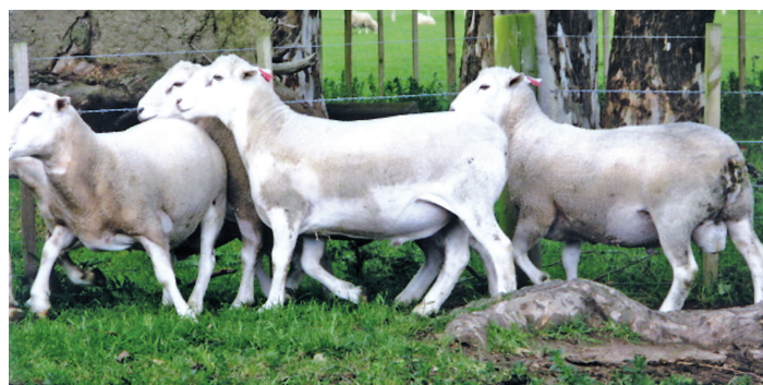
Free moving, sexy Dorper sires. Out mating with ewes every 73 days all year round at OSRS