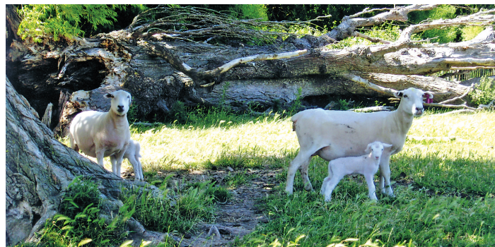
October born Dorper lambs.