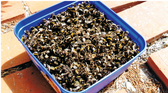
Owen River 'glass' house full of bumble bees, which died eventually. Apiarists could not explain this behaviour. 2000 per litre. Eight litres emptied.