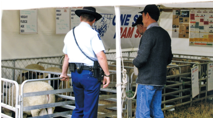
First visitor. We asked lots of questions about policing, he lots about sheep. Southern Field days, Waimumu. 13-2-08.