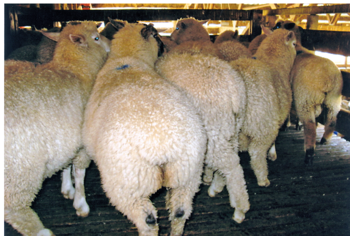
Well grown sappy, Texel-Suffolk sired lambs 'ready'.

Braden Cooper and Robyn Irvine, Owen River.