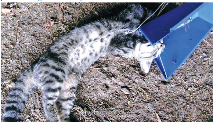
Traps work. Sixth wild cat killed in six weeks at Paratu.