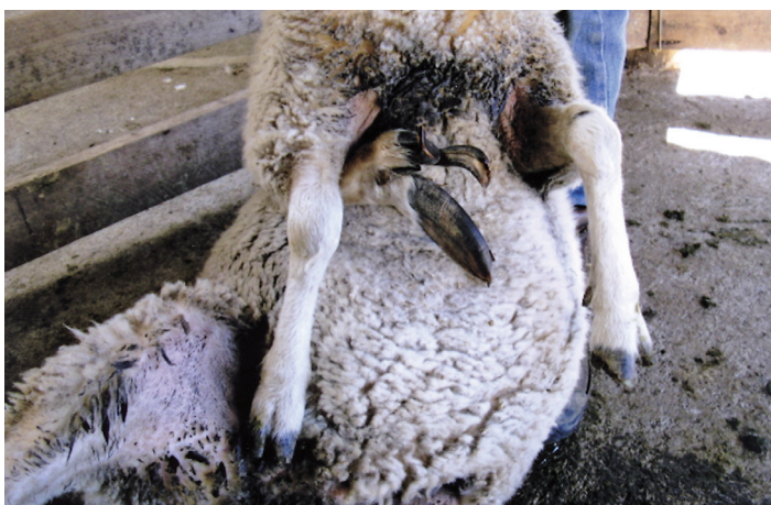
Too many feet. Extra feet are of no use.