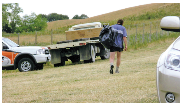
Waimumu volunteers made the site spotless daily.