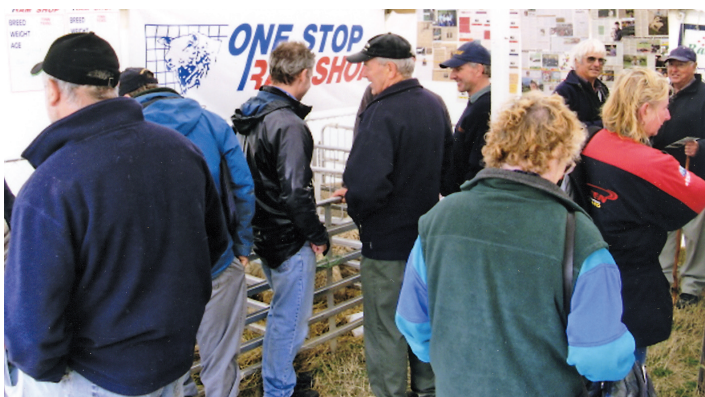
"Wow, this is the busiest tent at Waimumu", farmer. Southern Field days, Feb, 2008