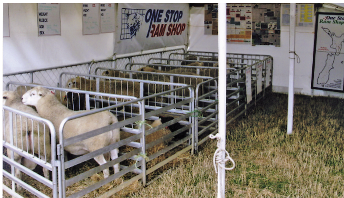
OSRS exhibit. Lots of sheep, photos, coffee, fruit and visitors.

INTERNATIONAL NEWSLETTER No. 69 April 2008