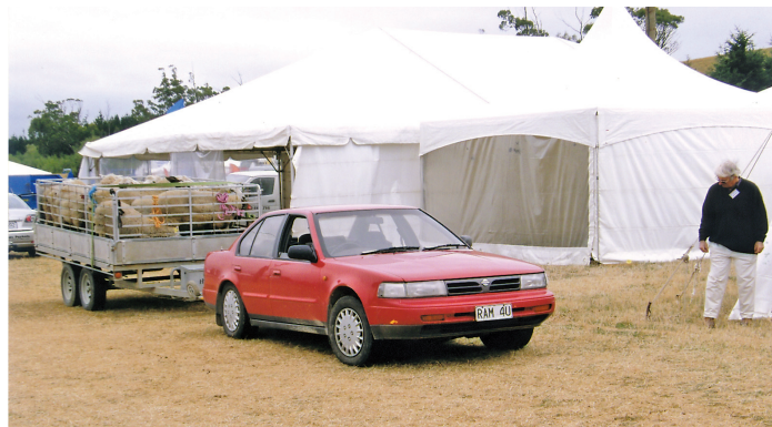
Loaded. 2.5 tonnes for Te Anau. Wrecked the automatic transmission.