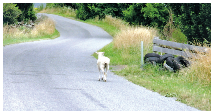
New Zealand's last ewe looking for a future.

Personnel have changed; farming topics are similar. Production of the newsletters and photos has really improved.