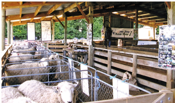
OSRS exhibit at Guy Bellerby's farm.