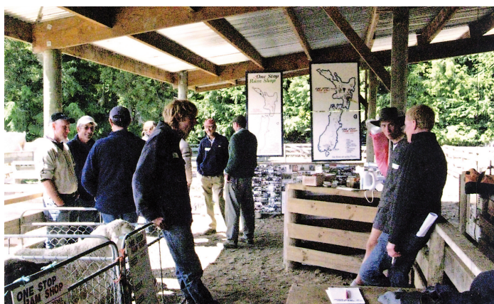
Openday. Canterbury, Denmark, Southland visitors.