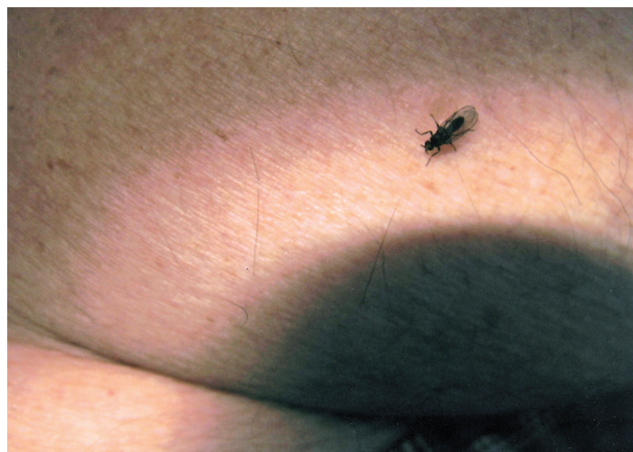
Powerful predators. Sand flies hurt. Ouch! Haast, Jan 2008.