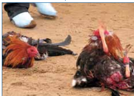
44. Cockfighting. Spurs are lethal, crowds impassive. Handlers suck blood from the exhausted birds mouths, then blow in beer (salts) and its all on again.