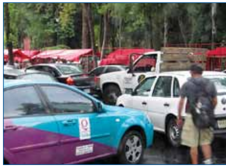
2. Traffic moves easily as do pedestrians. No honking, few dings. Mexico City