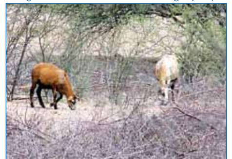
42. Sheep look like goats, but are worth more. Restaurants grind sheepmeat into a paste with no commendable taste. Constitucion