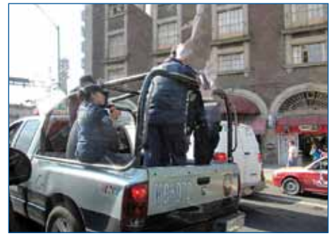
3. Armed Police are everywhere. They drink coke and talk on cellphones. Mexico City