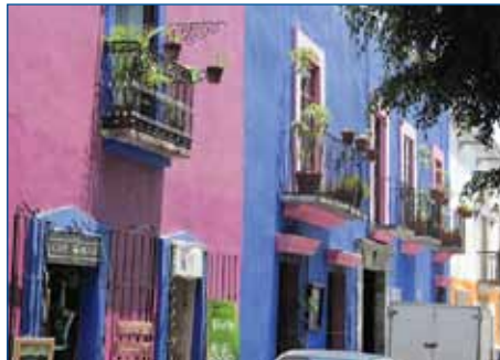
11. The colours of Latin America, vibrant, crazy and very appealing. Puebla.