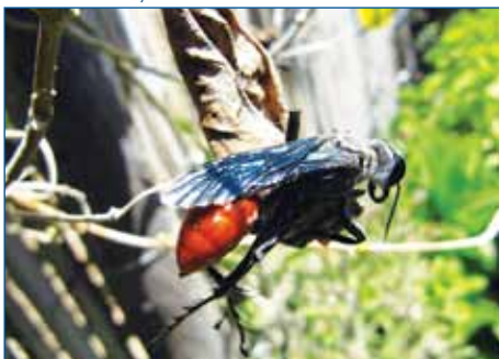
40. This 4cm hunting wasp preys on tarantulas. Spiders are stunned, buried and eaten by the wasps offspring.