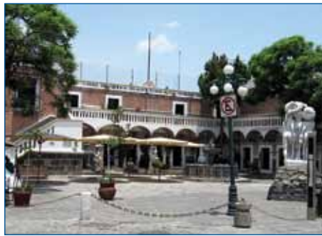
17. Mexico is a country of statues; huge and small, old and modern; they are distinctly Mexican. Puebla