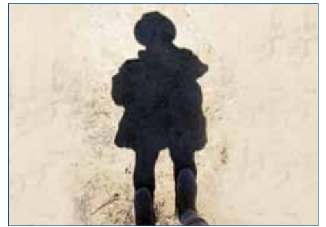
33. Desert sunshine creates odd shadows. This Kiwi desert man is not in rain gear.