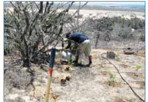
24. Greening desert. Water is gravity feed into drip feed lines. Each plant has some rich earthworm poo under the roots.