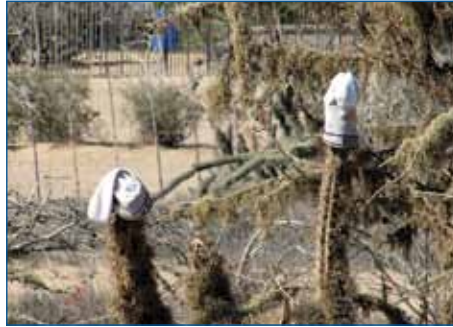
35. Sock cacti. 210 kms motorcycling in deserts. Lots of wildlife, odd plants, awkward terrain and frightening surprises.