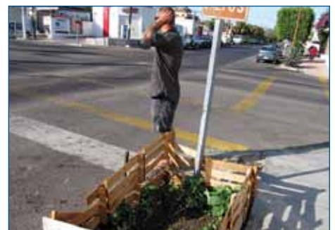
45. Tiny vegetable gardens use road verges. Heavy metals from car exhausts are not an issue here. La Paz, Baja, July 2010