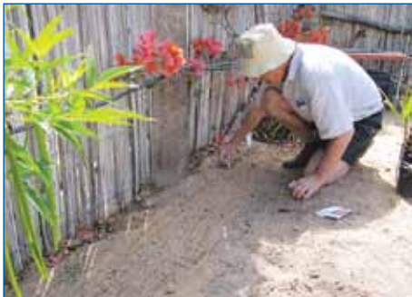
22. NZ radishes. 75hrs to emerge, 4 weeks to consumption. Packet said 6 weeks to maturity. Plants grow fast in Baja if given water.