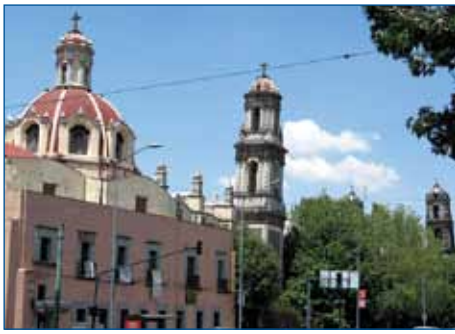
1. Leaning spires and sinking buildings of Mexico City.