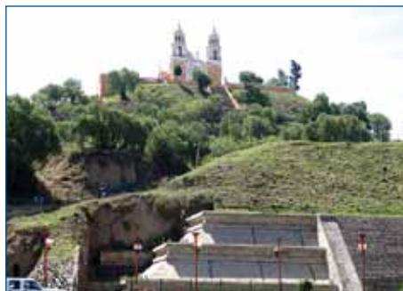
14. This Franciscan church was built on a pyramid which has eight kilometers of archeological tunneling beneath. Cholula