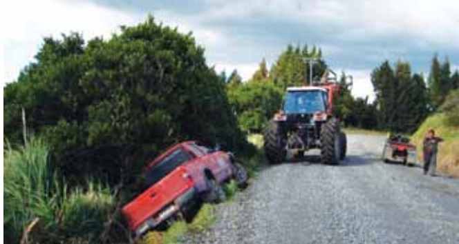
An example of wwoofer driving.