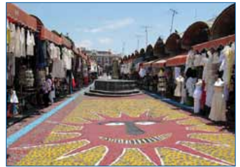
18. Garment shops only. Whole streets sell only one product be it jewellery, food, shoes etc. Puebla