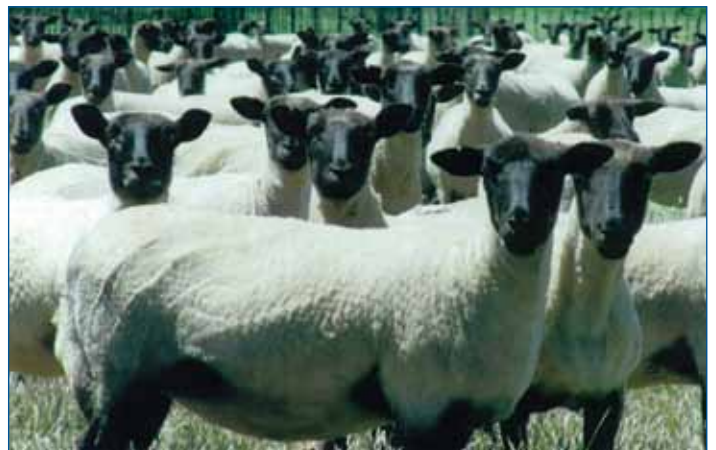
Texel - Suffolk