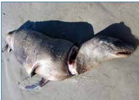
37. Seal get caught in nylon nets. Worried fishermen cut them straight out. Carcasses are monitored by researchers.