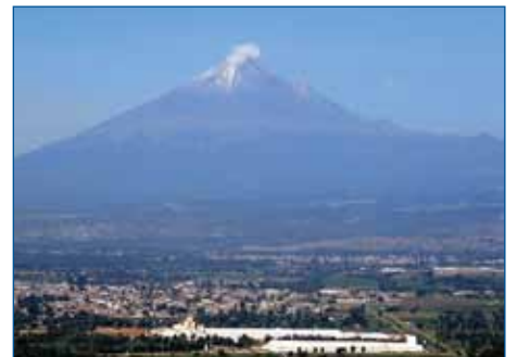
9. Popocatepetl erupts continually but does provide versatile soils which have been cultivated for 4000 years at 2500m a.s.l.