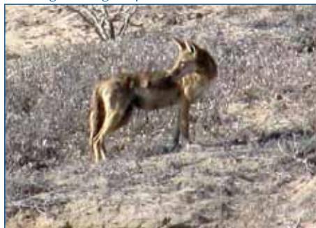
38. Baja coyotes are small, common and yap with alarm. Coyotes lure town dogs into the desert and kill them. Prime predators.