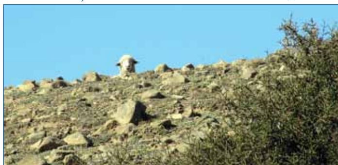
A curious ewe watched RAM 4U.