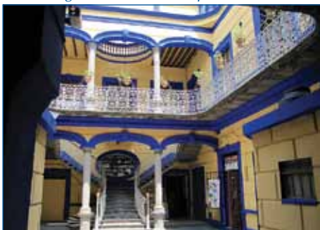
13. Buildings are old, well designed with distinct unique features which gives individual character. Puebla