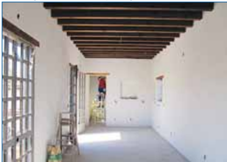
25. Office building getting finishing touches. Oregon beams and high ceiling will keep the room cool.