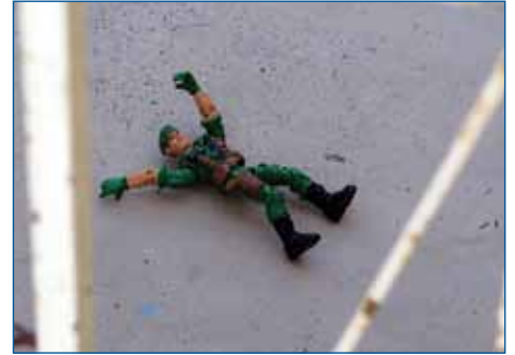
21. Ignominious end for a plastic fantastic toy soldier. It lies unloved on a roof; totally forgotten. San Juanico