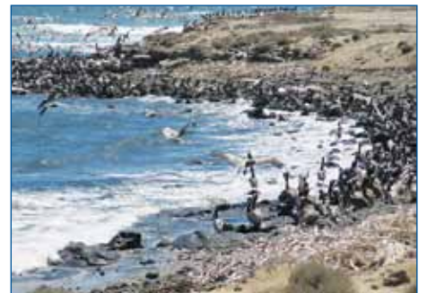
39. Pelicans are ungainly on land but elegant in flight as they utilize every air current, and stream along. Their numbers are increasing rapidly.