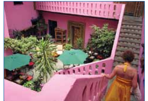
12. A pink antique shop, cum hotel, cum restaurant. Puebla