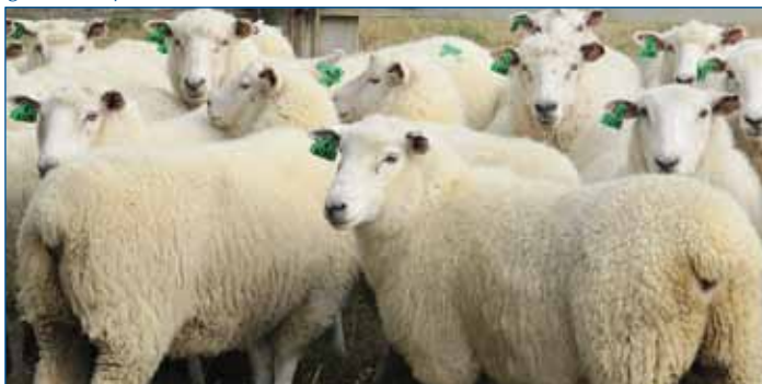
For fifteen years, only Finn Texel rams were used on a “hot” facial eczema farm at Whatawhata. Now, OSRS has these ewes mated to high resistant rams in HB.