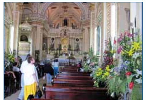
15. Churches maybe almost vulgar with their ornateness. All pyramids have crowning churches and competing loyal congregations.