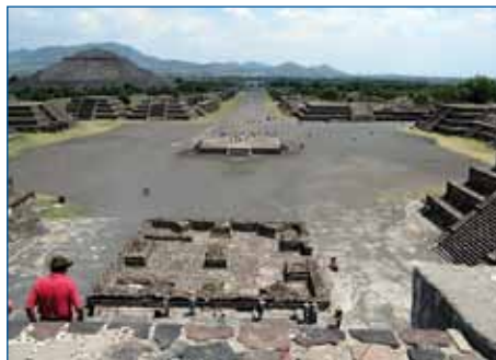
8. Moon Pyramid. Sacrificial victims, minus hearts got thrown down. Easier than climbing down as we did. Teotihuacan.