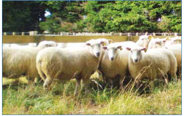
Finn - Texel