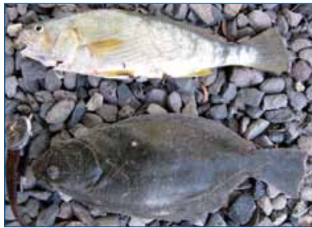
32. Halibut, cod and stingray Robin caught surf casting. Excellent eating. A cold ocean caused poor fishing. San Juanico