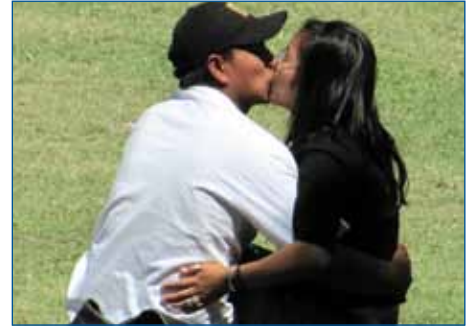
6. Nobody gawks, except Kiwis. Cholula.