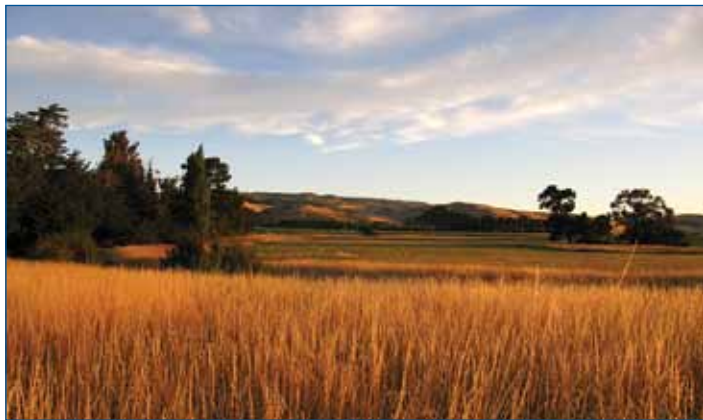
7.38pm. As the sun sinks the ripening roadside grasses light up to give North Canterbury landscape hues found nowhere else in NZ.

INTERNATIONAL NEWSLETTER No. 85 August 2010