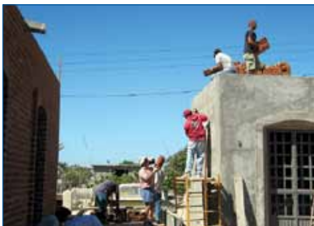
28. Mexicans move tiles by working together; they are swift and efficient. "Many hands make light work" is true.