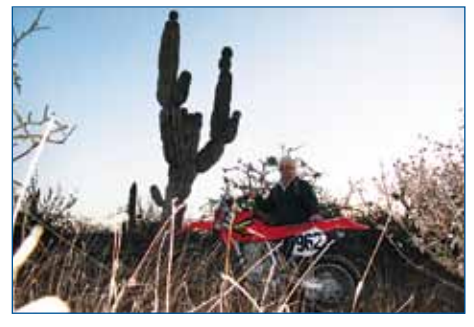
30. Sunrise. Cardon cactus is possibly 200 years old, they can reach 20 metres and live 600 years.