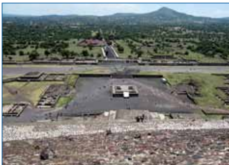
7. Sun Pyramid. Magnificent, stark, huge; steep. Only 1000 (tiny) tourists visible, there are usually queues everywhere. Teotihuacan.