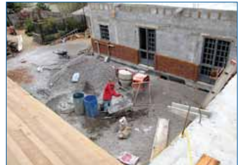
27. Aerial view of the building and nursery.