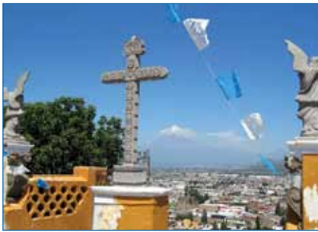
16. The state crushed the power of the catholic church then took over the maintenance of its buildings. 30 churches around here. Cholula