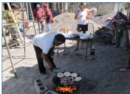
29. A breakfast feast (at 10am) to celebrate finishing a major task. Crabs and kide were deep-fried to perfection. Eating is serious business.