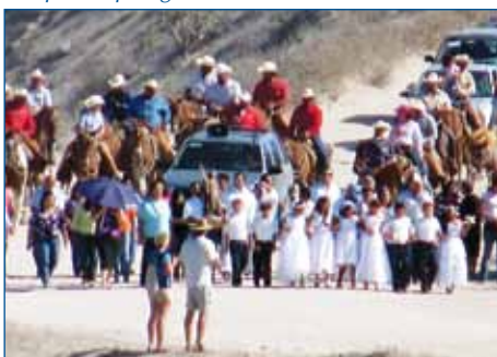
43. This procession of communicants and relations marched through the village. San Juanico Day, 29 June, 2010.