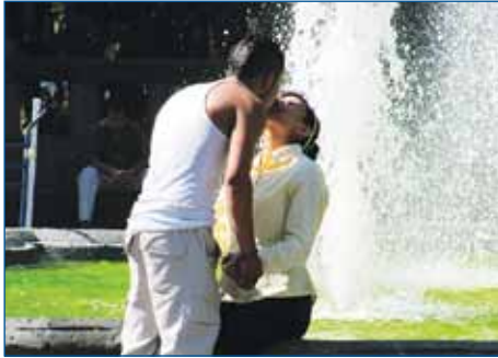
4. Long, languid, lingering, sensuous kisses...