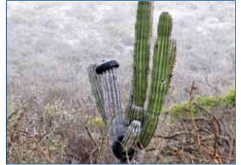
36. "Tyred" cardon cacti. "Tyred" cacti are often found near the highway.