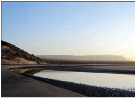
31. Sunrise. El Mequital arroyo flows into the Pacific. Hidden soft spots are impossible for a motorbike to traverse.