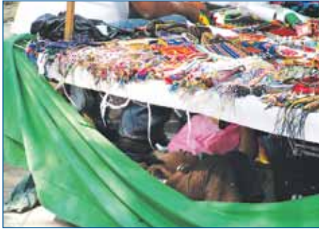
19. Stalls provide shade for children sleeping. Mexico City