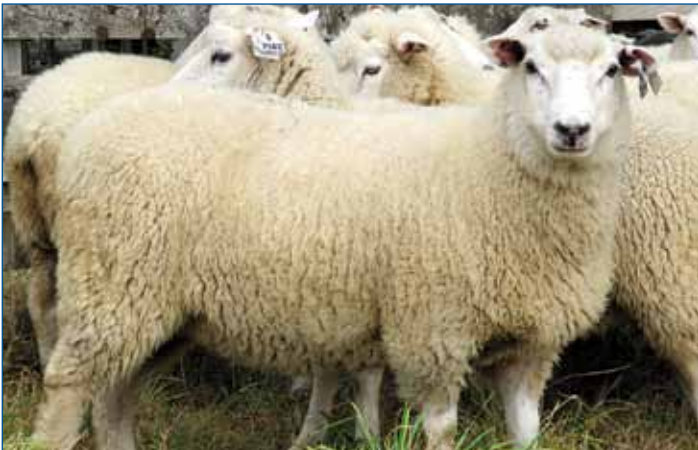
Stabilised, 3/8 Finn 3/8 Texel 1/4 Romney