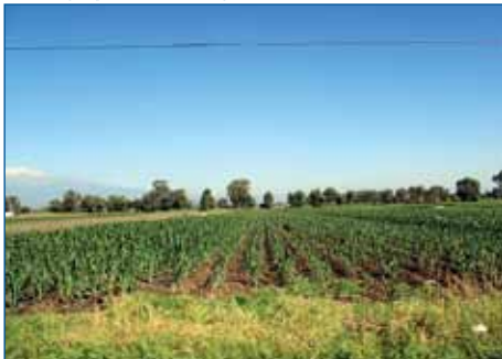
10. Intensive agriculture is impressive. Small, sheltered paddocks, soils with good texture. Maize is grown where ever possible.