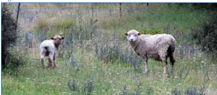
Descending wool prices have seen corriedale ewes in McKenzie country mated with terminal sires. Now the ewes do neither the wool nor meat job well.