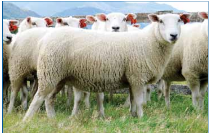
Stabilised, 3/4 Texel 1/4 Finn