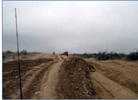
20. 100 trucks are involved building the new SH1 on Baja. When completed the trip to US will be four hours shorter. Insurgents