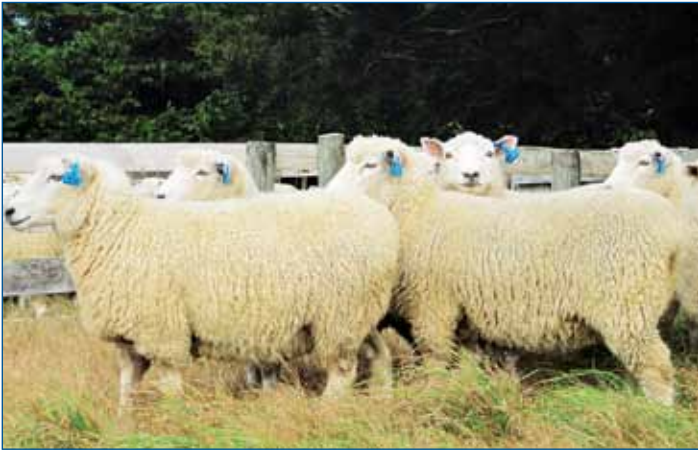
Stabilised, 1/4 Finn 1/4 Texel 1/2 Romney