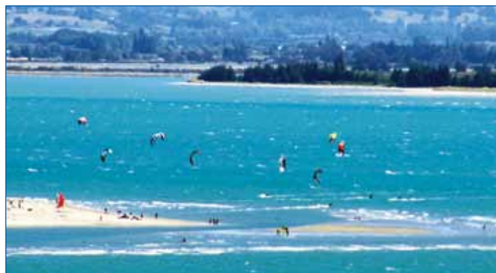
Nelsonians at play. Gaudy parachutes wiz skiers all about the turbulent estuary waters at Tahunanui.