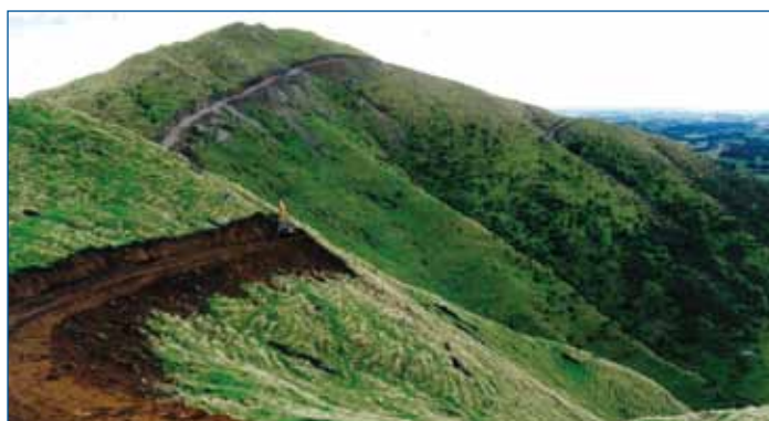
Metre deep young brown forest soils at the summit of Maire Hill. Grass grows all year. Rainfall 1200 mm. Summer safe.

Don’t try to repeat this driving test. Everyone understands why OSRS has a “wwoofer mobile”.