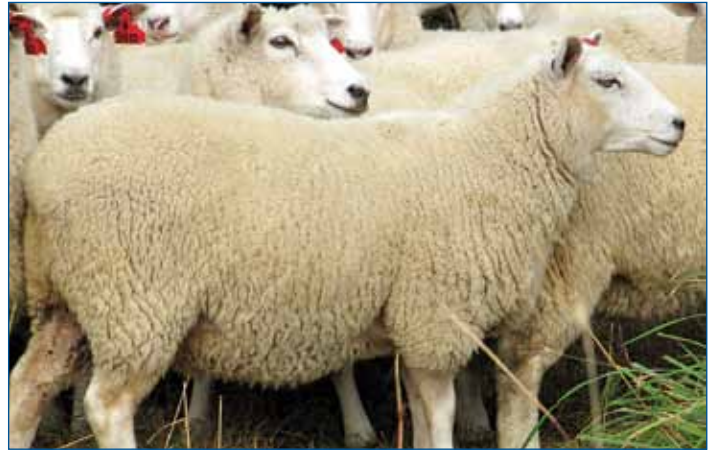
Stabilised, 1/4 Finn 1/4 Texel 1/2 Perendale