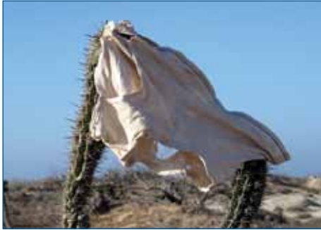
34. Underpants cacti.