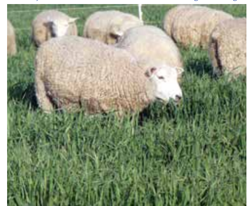
Ram hoggets on green-feed oats. July 2020