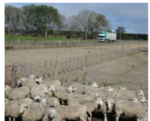
SH2 lockdown. No traffic, no rubbish, no noise, no visual pollution. Bliss! OSRS, May 2020