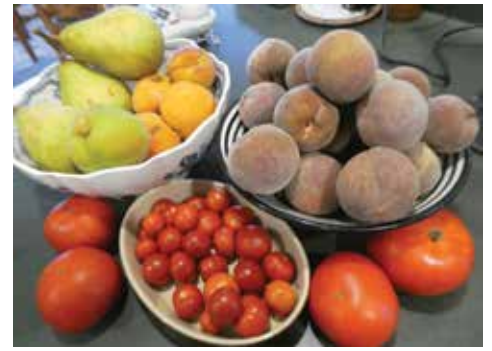
Mushrooms, grapes, feijoas, apples, tomatoes, citrus and raspberries finished in June or July. A large quantity is frozen for next 'lockdown'.