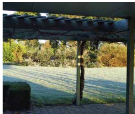
Pruned feijoa and kowhai. First frost. May 2020