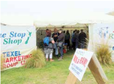
Waimumu, Southern Field Days. OSRS has exhibited rams in Southland, since 2008