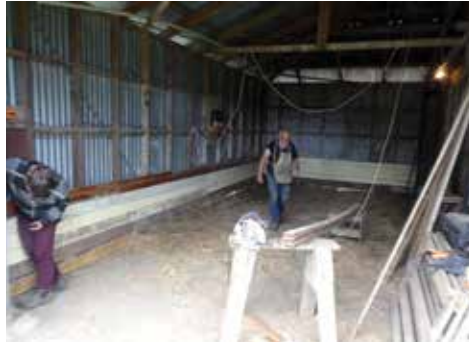
Isolation site two. Lined walls. Private, rather primitive. Oven, power, spacious.