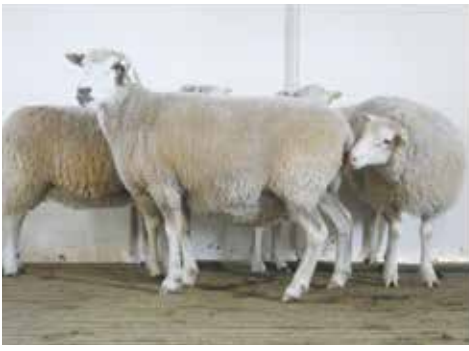
Finn Texel 9148/16 weaned at 120 days triplet ram lambs. Their combined weight was 110kgs or 1.81 times the ewe body weight of 60.5kg.