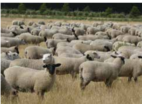
Texel Suffolk and Finn Texel twin ewe lambs. OSRS, Jan 2020