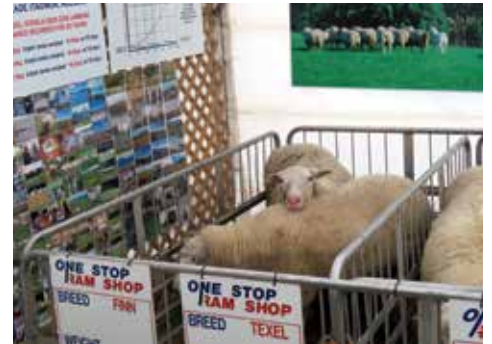
Bored Finn rested on his Texel companion. Three days watching people is tough.