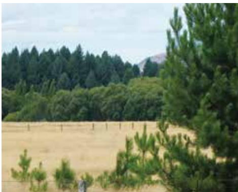
Why plant a billion pines? 1 billion wildings establish annually in the McKenzie Basin. Lake Pukaki wilding pines before the August fire. Feb, 2020