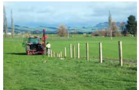
New fences, 6.2 kms. Erected April to September.