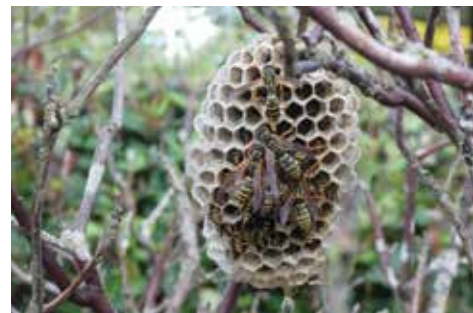
Dozens of paper wasp nests. Voracious predators annihilate monarch caterpillars. OSRS, May 2020