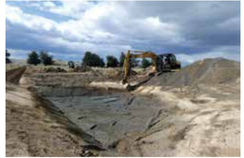
One of two conservation ponds. June, 2020