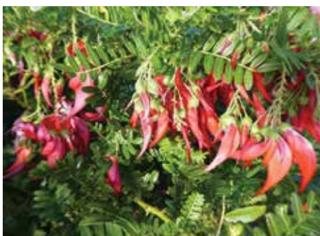
Kaka-beak splendour. Many are in the OSRS garden. They grow from seed easily. Sept, 2020