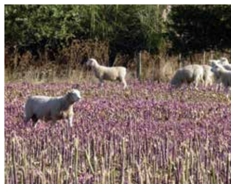
Raphno fed ram hoggets well in March/April. There was nothing else until September. OSRS April 2020