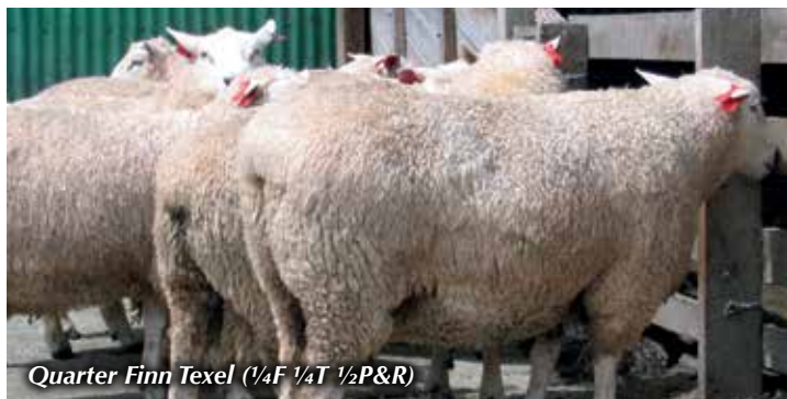
Quarter Finn Texel (1/4F 1/4T 1/2P&R)