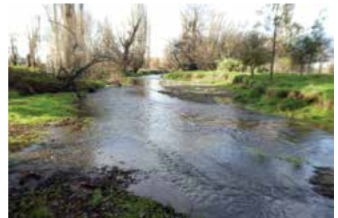
Porangahau creek. Canoes linked Waipawa to Takapau.