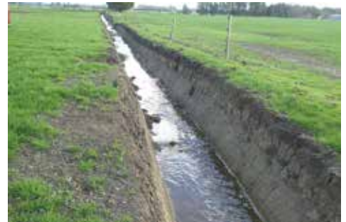
New stream bed. Meanders gone. Double fenced.