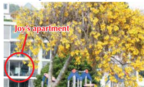
Waitangi Park. Spectacular Kowhai. Oriental Parade Wellington. Sept, 2020