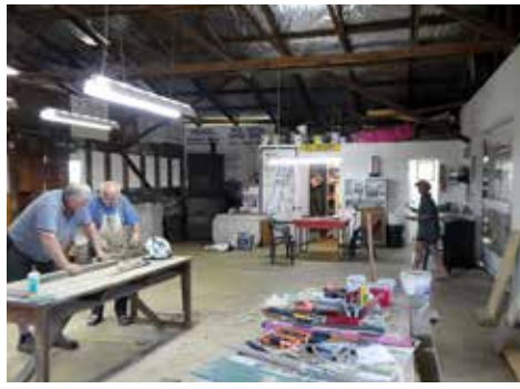
Isolation site one. This lockaway (at back-centre) has an oven, wc, shelves. Ideal for one person.

OSRS stabilised breeds have decades of data behind them. However, they continue to surprise with their resilience and productivity; traits which OSRS has taken to every sheep-farm area of NZ. OSRS sheep last and last. OSRS sheep are tough and look good.