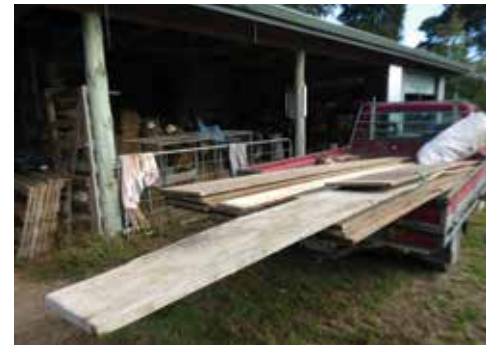
Magnificent recycled timber was used in all three sites, greatly reducing the stored hoard.