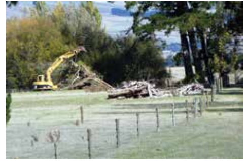
Fallen limbs stacked for burning.