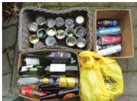
11kgs waste for recycling. Total from four adults during levels three and four. Paper was burnt. June 2020

Titirangi, Auckland. Wild chooks made world news. They were being caught and given to 'loving' homes. Then came 'lock-down'. Chooks emerged from lockdown in greater numbers. Fowl surprise?