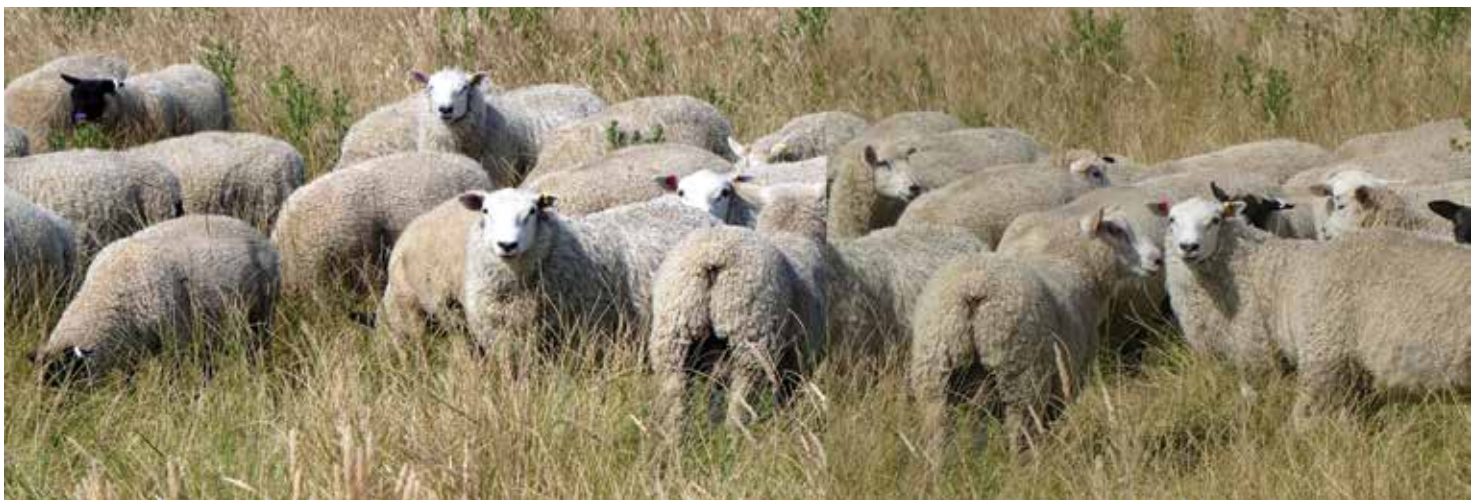
Finn Texel and Texel Suffolk ram lambs. Weaned and thriving.