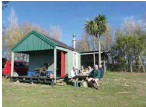
Isolation site three with bubble team. Woodfire. Well equipped. Private. Generator for electricity.