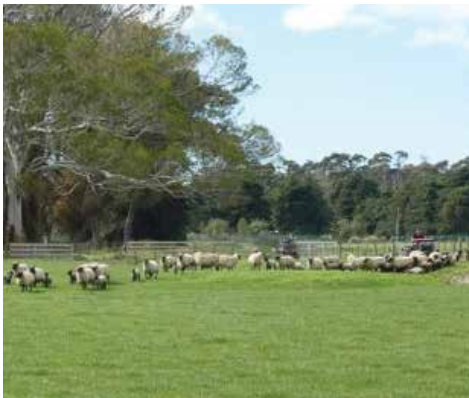
Ewes and lambs yarded for docking. Lambs were tagged at birth. OSRS Sept, 2020

Why has it taken 100 years to rid functionally useless ties from dress code?