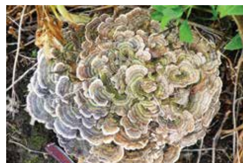
Beautiful fungus on a stump. Notice pocket knife.