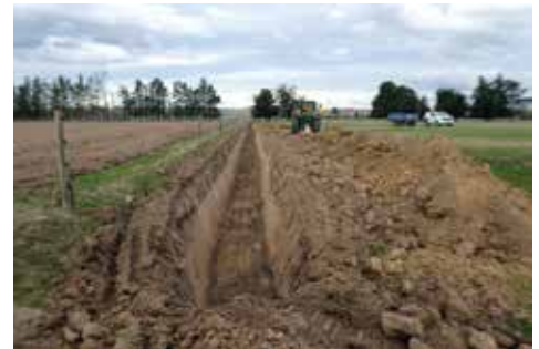
Native planting to be completed in 2021.