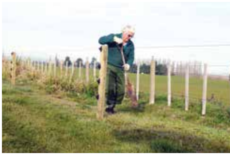
Blanking gaps with ToeToe. 40kms of shelter completed since 1970. Another 1.5kms by 2021. Aug 2020