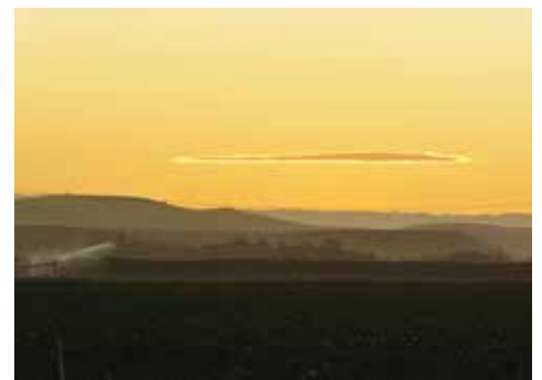
Spectacular sunset 'lens' cloud. Last picture show. Waimate, 11 Feb, 2020