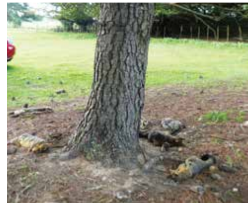
Possum bodies. 50 shot, 41 poisoned. OSRS new farm.