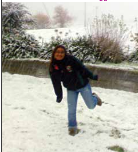
Unhappy blogger. Two neighbouring houses, beyond the trees, are hidden by snow. OSRS Oct, 2010