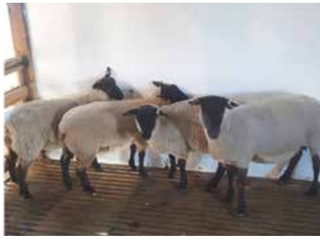
Texel Suffolk 3277/16 weaned at 120 days triplet lambs; two ewes, one ram. Their combined weight was 113kg or 1.82 times the ewe's body weight of 62kg.