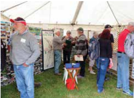
Inside the exhibit. Plenty of farmers and questions. Southern Field Days, 12-14 Feb 2020