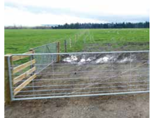
6.2kms of boundary, lanes, riparian and subdivision fencing. OSRS new farm. Sept, 2020