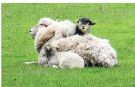
Grubby Finn Texel twin lambs. OSRS Aug, 2020