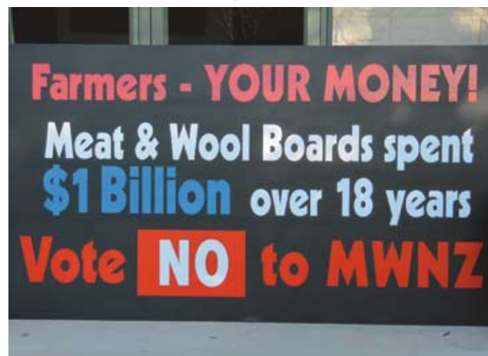
One Stop Ram Shop signs erected on SH2 and SH50 giving a clear message July 2009