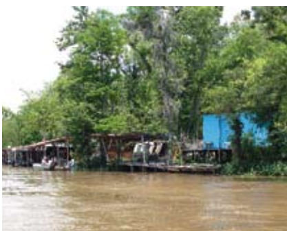
These small homes were under 6metres of water. Many have been rebuilt. It will happen again.