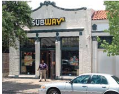
Posh suburbs are best viewed by tram. This driver stopped mid-route for a 15-minute refuel at Subway. Passengers just waited.