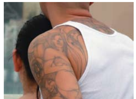
Do girlfriends really enjoy these crude tattoos of naked women?