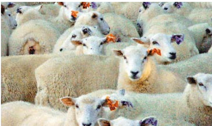
Two tooth Texels and Finn- Texels,