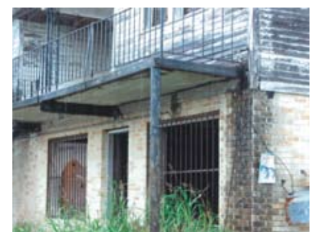
Once drowned, mud filled, putrid buildings are abandoned throughout New Orleans. Wrecked.