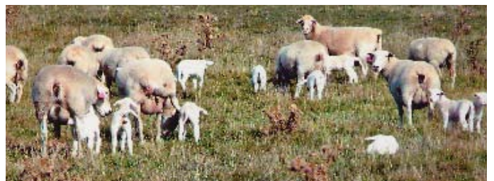
Dorper ewes and lambs.