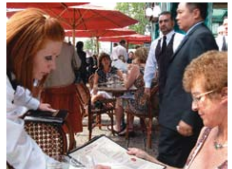
'The Strip'. Expensive eating. Efficient service from 'mature' waiters