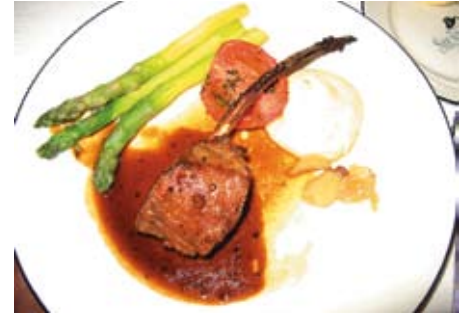
Lamb chop, $NZ75, with vegetables extra. One serving was big enough to feed two Kiwis.