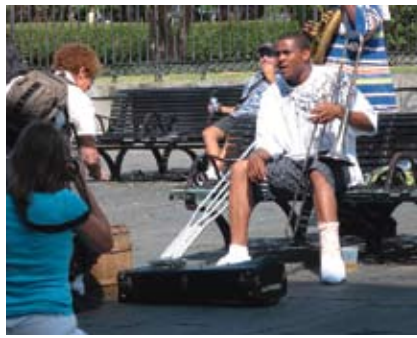
Pure jazz by vibrant songsters. Joy giving a reward. New Orleans May 2009

Needed; cool heads to ponder each issue and remove some because they are foolish eg. foot and mouth disease (its not important, just an artificial trade barrier), emission trading scheme etc.