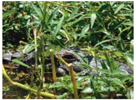
Crocodiles are back. Protected and feared they are prime predators, second only to man.