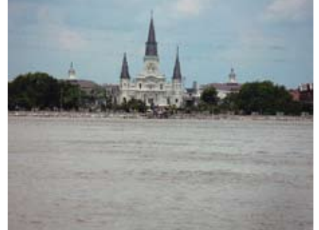
Gracious cathedral in the central square, close to the huge, muddy, swirling Mississippi River.