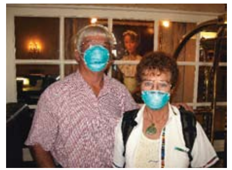
Two Masked Kiwis. Nobody took swine flu precautions in New Orleans or USA. Omni Hotel, New Orleans.