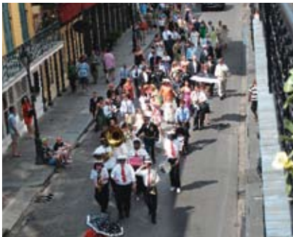
Jazz bands lead colourful wedding processions through the French Quarter to receptions.