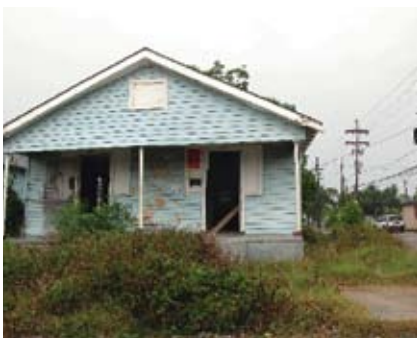
A cross on the porch wall tells a tale. How many died and the date of the search. Condemned. Years after Katrina.