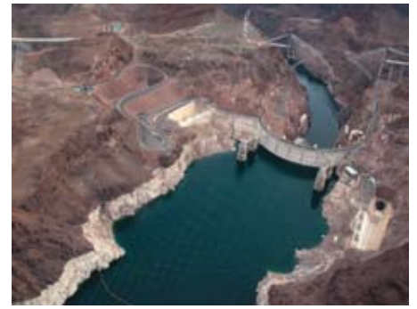
Albeit the Hoover Dam is spectacular, Lake Mead is a scary 20m (white line) below capacity.