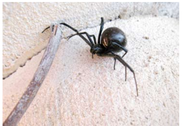
Black Widow usually placid and furtive. This stirred-up female is ready to strike. The world's most poisonous spider species. San Juanico, June 2009.