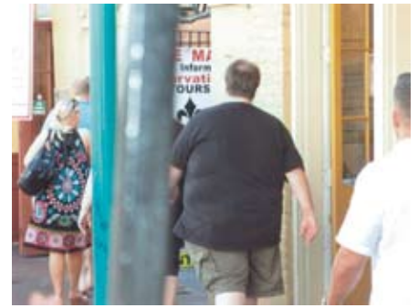
Authentic cajun delights and plenty of deep fries keep people huge.