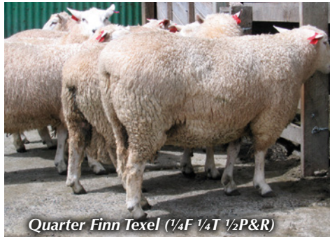
Quarter Finn Texel (¼F ¼T ½P&R)

Teasers, all Finn crosses, young and sexy $250.