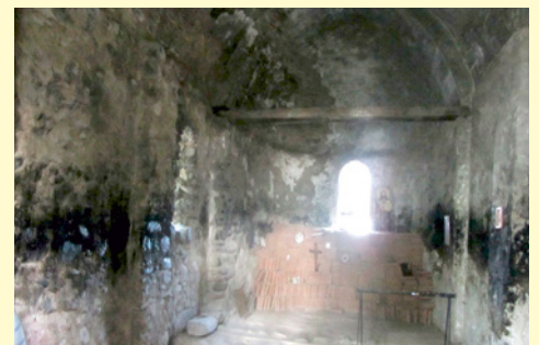
Russians vandalised village churches. Now churches are being refurbished.