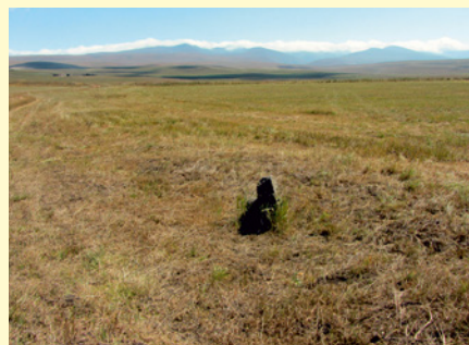
Boundary cairn Georgia. Stock and people do not pass. Open country through to Mongolia.