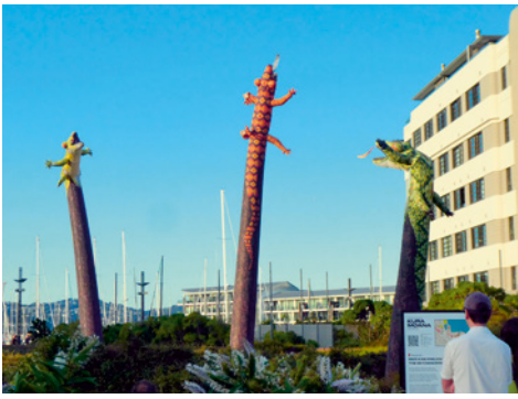
Colourful inflated lizards, 'arty' Wellington April.