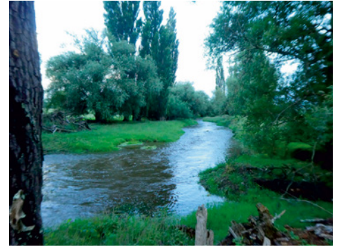
Flooded Porangahau stream provided canoe access between Waipawa and Takapau Pas.