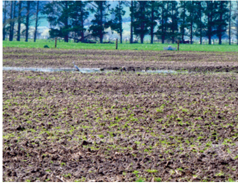
Water-logged paddocks. Rain fell each day from June on.