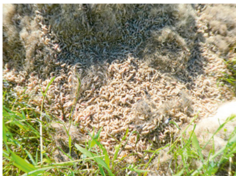
Blowfly maggots are useful. Carcasses disappear.