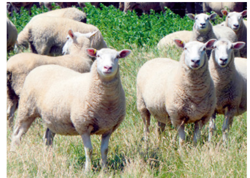
Finn-Texel two-tooth ewes.

Tags are unnecessary for biosecurity. Long, lean NZ could be closed easily with road-blocks . Few are needed to isolate any area. Movement control is easy in NZ.