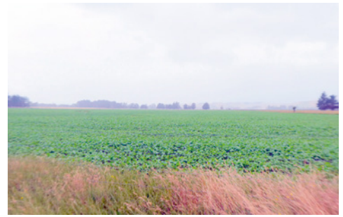
24ha of raphano for autumn feed.