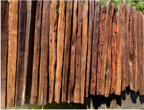
OSRS: Thousands of beautiful native battens are for sale.