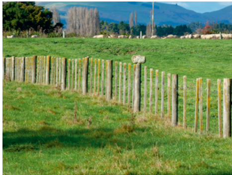
The stone looked like a crouched hare. Once lifted onto the post it was never shot again. OSRS.