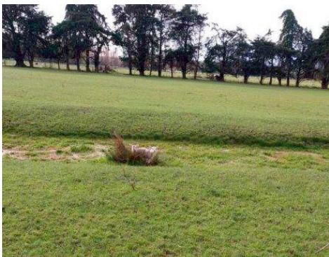
Lambs on island. The only dry place.