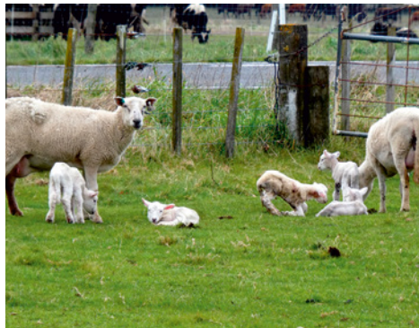
Wiltshire ewes and lambs. The two-tooths docked 150%.