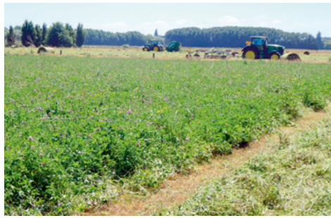
Excellent growth. 500 haylage bales. February