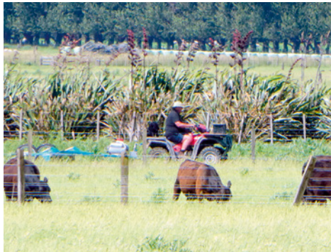
Trevor Bokser weed-wiped many hectares of thistles successfully . January OSRS.