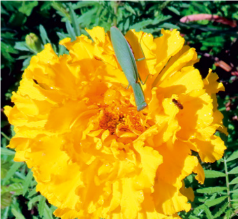
Praying mantis about to seize a hoverfly for lunch.