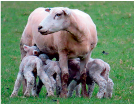
Finn Texel ewes milked well.