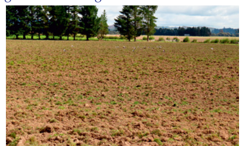
Mistake. 7ha of new pasture disced by contractor. Costly. March 2022