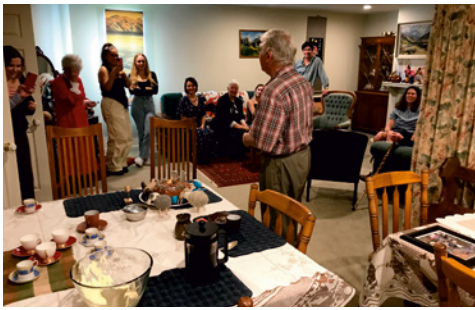
Family gathering. Covid lockdowns isolated everyone and stopped gatherings. Aug 2022