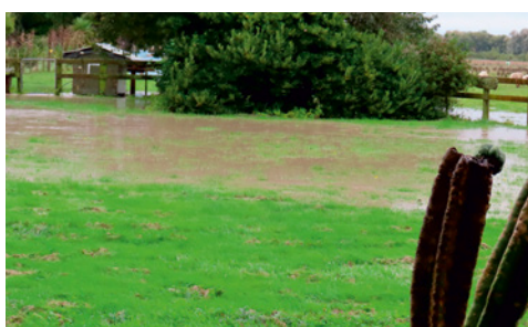
Garden covered with creek water. May 2022

Deferred Grazing, Organics, Regenerative Pastures are all unscientific and have been tried by most pastoral farmers, including OSRS, and dropped. Claims that produce from these practices is healthier is not proved. If consumers want products raised by these methods and pay more that's good marketing.