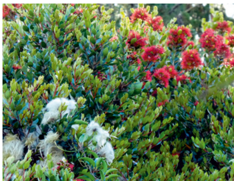
Rata (from Waikaremoana) and Clematis (home grown), flowering. OSRS Nov-Dec

If he had gone to Balmoral I could have visited him and the Queen could have come for tea at OSRS (as was standard for dairy farmers who gifted Jersey cattle). I wonder what sort of tea she would have enjoyed in HB?