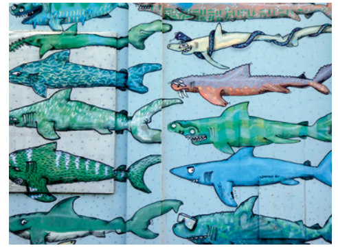
Colourful sharks look quite friendly. Wall art. Wellington.