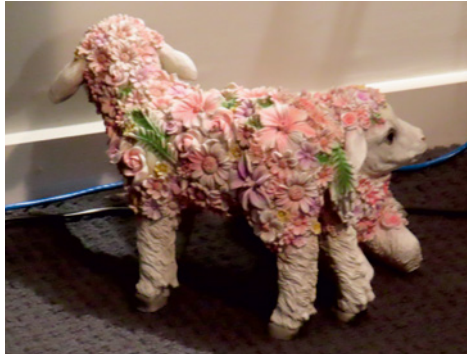
Wellington sheep frightened by Matariki fireworks.