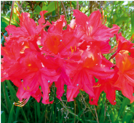
Spectacular Ilam azalea.