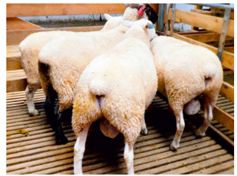
Texels and Texel Suffolk rams for Chatham Island Farmers. Jan 2022