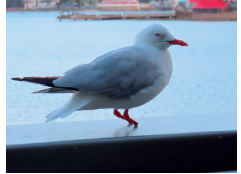
Some feat to lose both feet . Wellington.