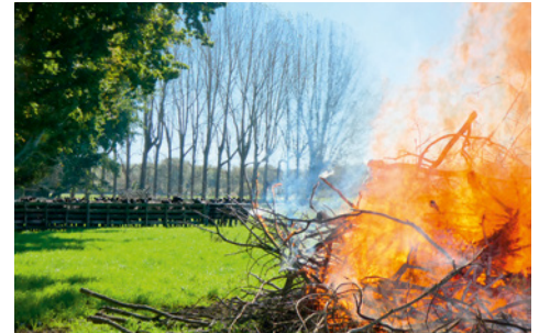
Cattle enjoyed all 'tidy up' fires, until it rained. April.

Builders, bakers and candle-stick makers are also over-whelmed. Governing sensibly is beyond Labour. Will other political parties listen and do better?