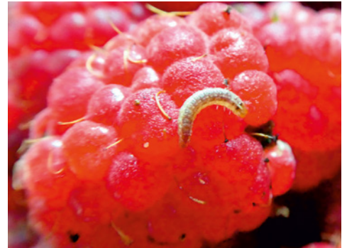
Voracious beetle larva with a liking for raspberries.