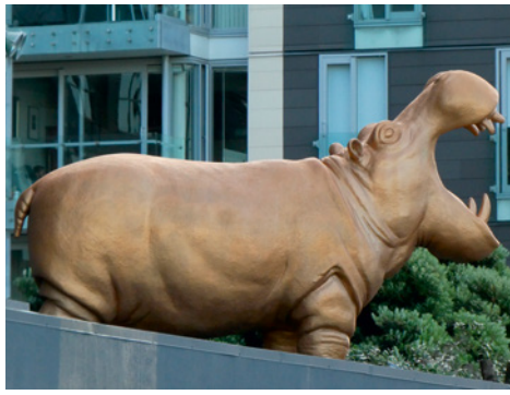
Golden hippo on a roof opposite Te Papa.