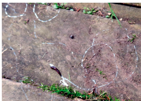
The dying dance of slugs. Poison prills work. June 2022

"We measured the nutrients in the blood .....and saw significant differences in the type and amount of amino acids from the digestion of protein of red meat compared to protein of the processed 'meat' alternative" Dr Broakhuis. Amino acids are of greater biological value and more easily absorbed.