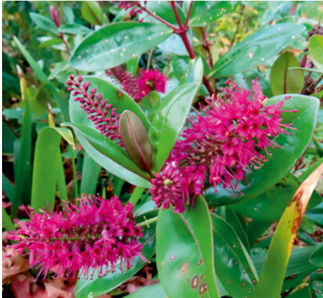
Hebe speciosa . NZ has 88 Hebe species

INTERNATIONAL NEWSLETTER No. 134 October 2022