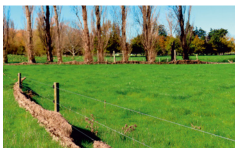
Floods wrecked internal and boundary fences. June