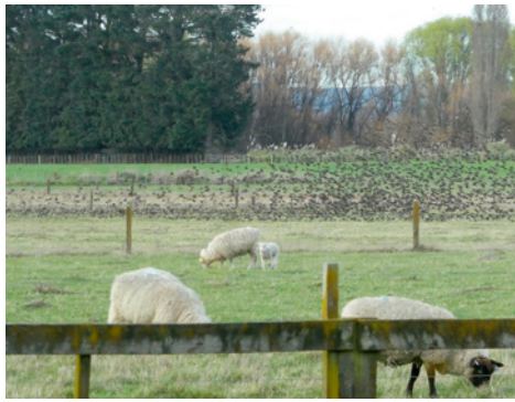
Drowning worms were a feast for huge starling flocks. OSRS, July.