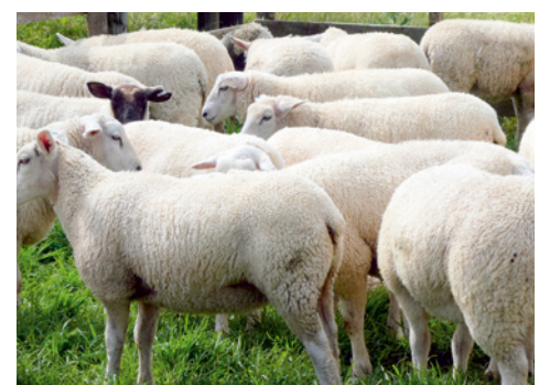
Finn-Texel and Texel Suffolk lambs.