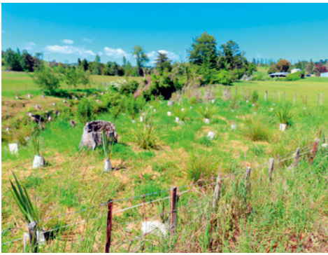
Riparian planting, Nelson. Common sight in rural NZ.