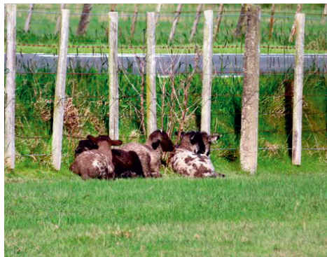
Lambs huddled on dry land. OSRS, September