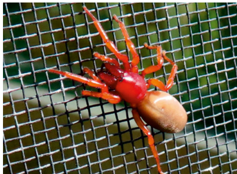
Sharing OSRS. Dysdera crocata , from northern hemisphere. Eats woodlice, a rare skill for spiders.