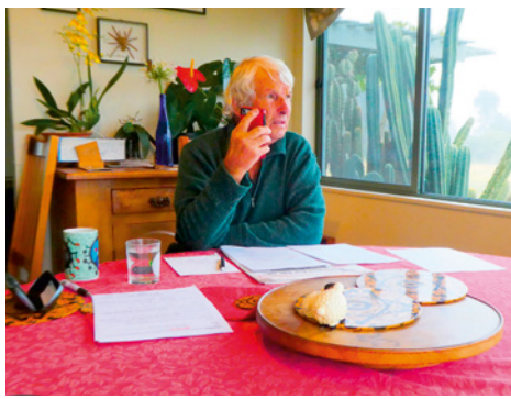
Looking for a day without rain. Annual rainfall: 650mm 2022 in nine months: 1126mm

15, New regulations have been made; were old regulations removed? Adding layers of rules is stifling business, slowing originality. NZ's 'can do' attitude is becoming 'can't be bothered'.